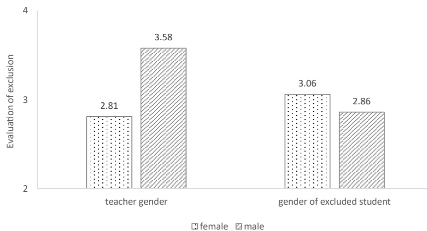
FIGURE 1 | Evaluation of exclusion as a function of teacher gender and the gender of the excluded student. High numbers indicate high acceptability of exclusion; low numbers indicate strong rejection of exclusion.

To test for differences in the likelihood of intervention, a 2 (participant gender: male, female) \times 2 (protagonist gender: male, female) univariate ANOVA was conducted. As preliminary analyses revealed no effects of participants' age or the years of participants' service experiences, these variables were not included in the analysis for the sake of a simpler model.