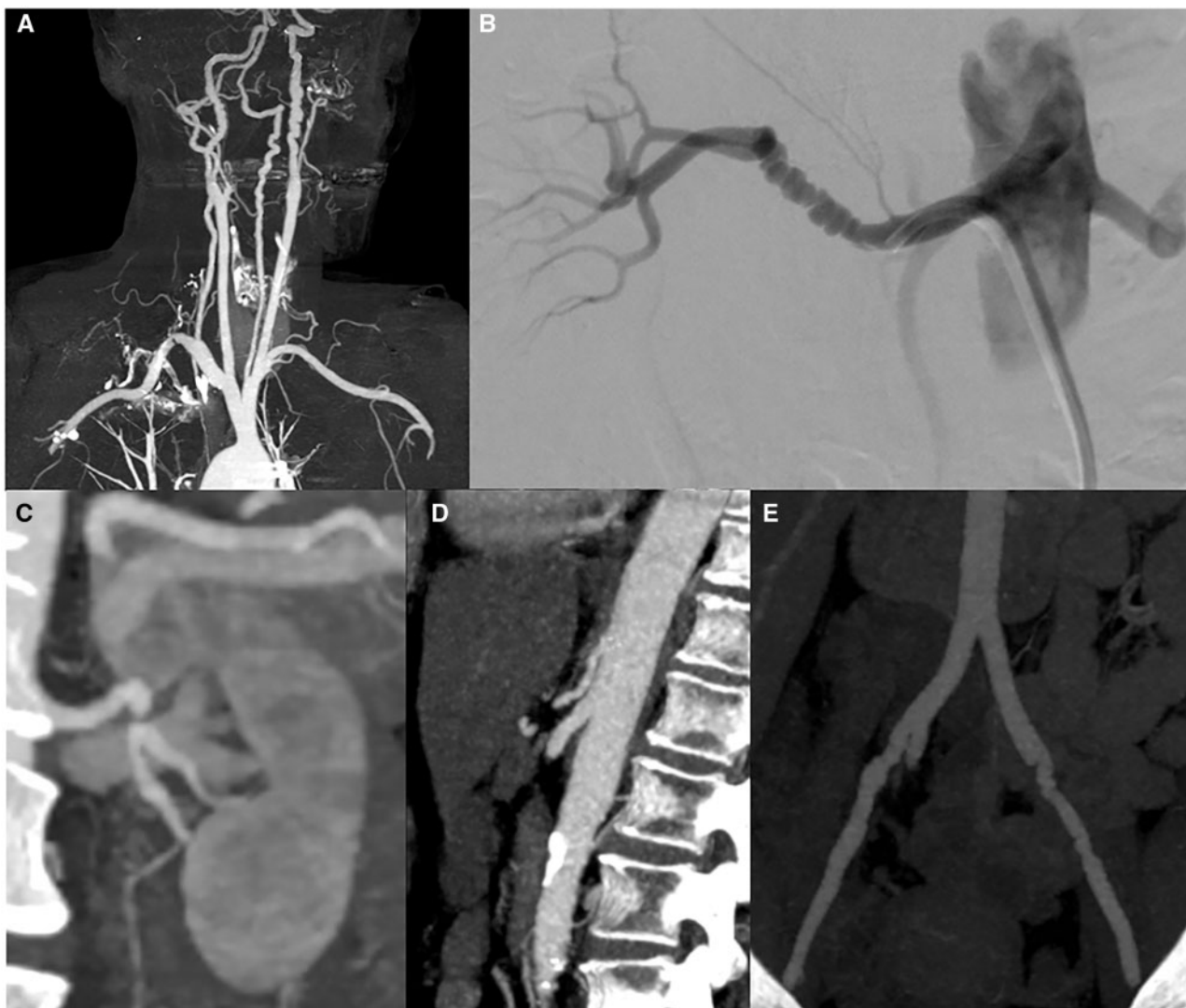
Figure 1 Examples of FMD lesions in various arterial beds. (A) Multifocal stenosis of the right internal carotid artery, of the left vertebral artery and of the left internal carotid artery. (B) Multifocal stenosis of the mid–distal segment of the right renal artery. (C) Severe focal stenosis of the distal segment of the left renal artery. (D) Multifocal stenosis of the coeliac trunk. (E) Bilateral multifocal stenosis of iliac common arteries.

Compared to younger patients, patients \geq 65 years old at diagnosis of FMD had more often multifocal FMD (85% vs. 71%, P value = 0.002 ) and