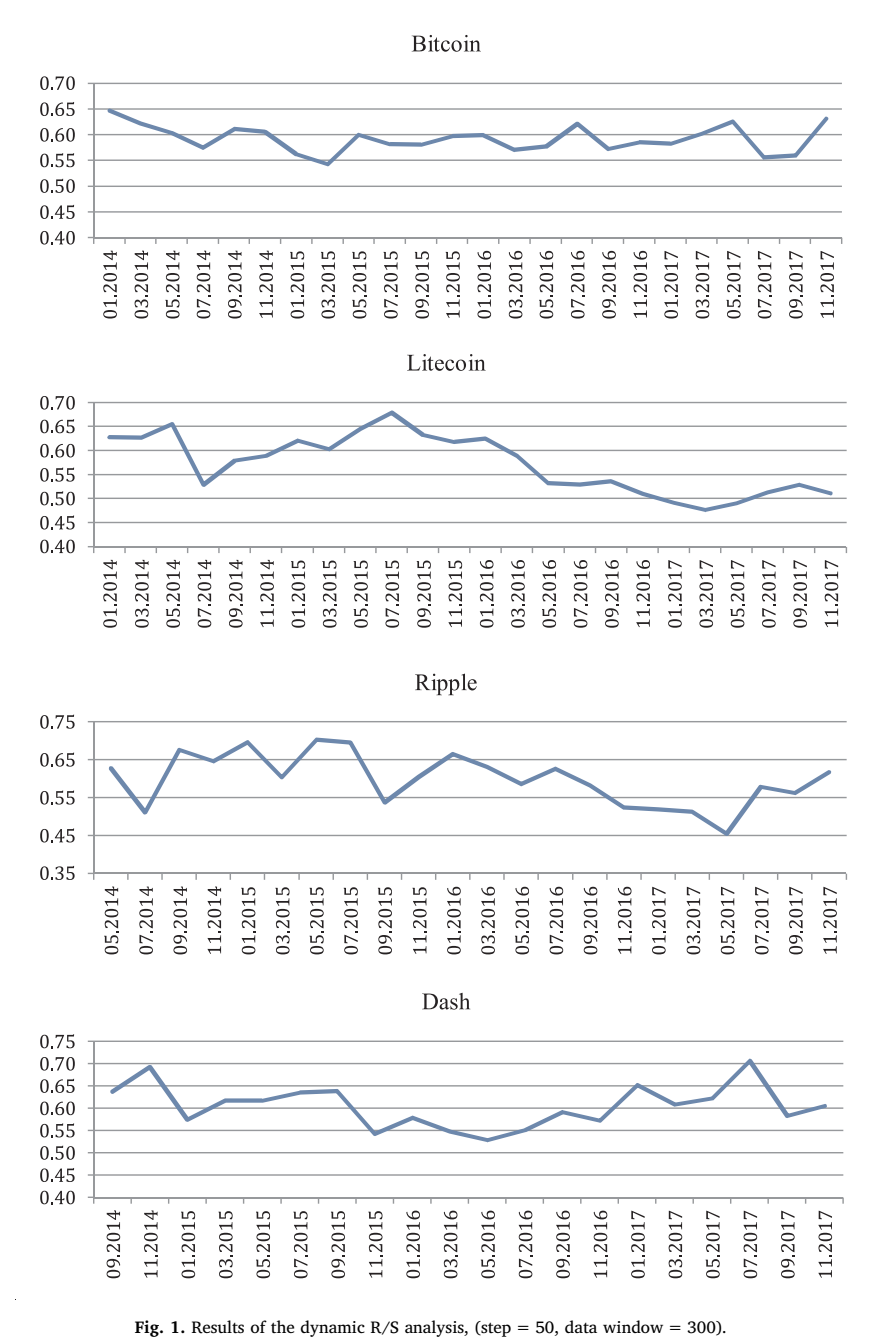
Table 3 Estimates of d and confidence bands for the case of no autocorrelation.