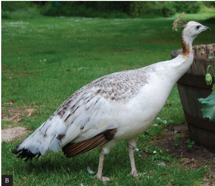
Figure 2. Black-shouldered Indian Peafowl Pavo cristatus , male (A) and female (B), Whipsnade Zoo, England, 18 June 2010; other than parts of the wing and shoulders, the black-shouldered mutation does not change male appearance, but it has a major effect on female plumage (Hein van Grouw)