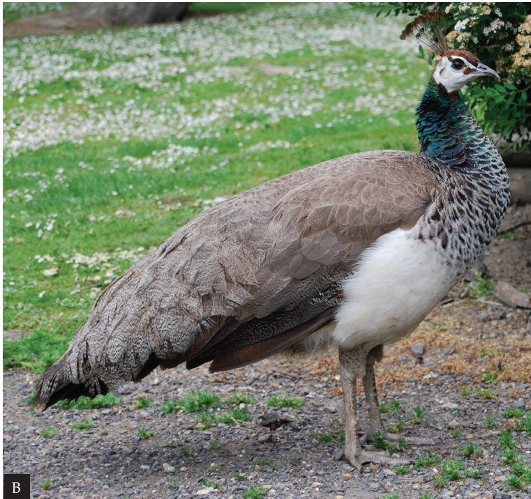
Figure 1. Normal-coloured Indian Peafowl Pavo cristatus , male (A) and female (B), Whipsnade Zoo, England, 18 June 2010 (Hein van Grouw)

as he thought species in the wild evolve slowly by natural selection through small modifications. Darwin was therefore keen to prove that Pavo nigripennis was a variety rather than a species.