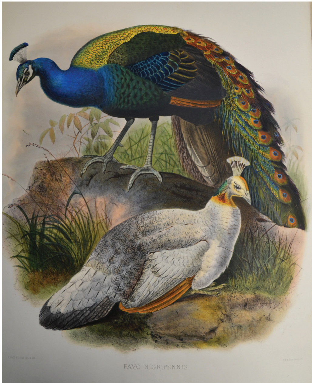
Figure 5. ' Pavo nigripennis ' in A monograph of the Phasianidae or family of the pheasants (Elliot 1872) drawn by Joseph Wolf (1820–99), lithograph by Joseph Smit (1836–1929)

caused Darwin some doubt, he finally correctly concluded that black-shouldered birds represented no more than a variation under domestication. Incorrectly, though, due to the lack of knowledge of genetic processes, Darwin believed that this variation was possibly induced by the climate or some other cause 'such as reversion to a primordial and extinct condition of the species' (Darwin 1868: 291).