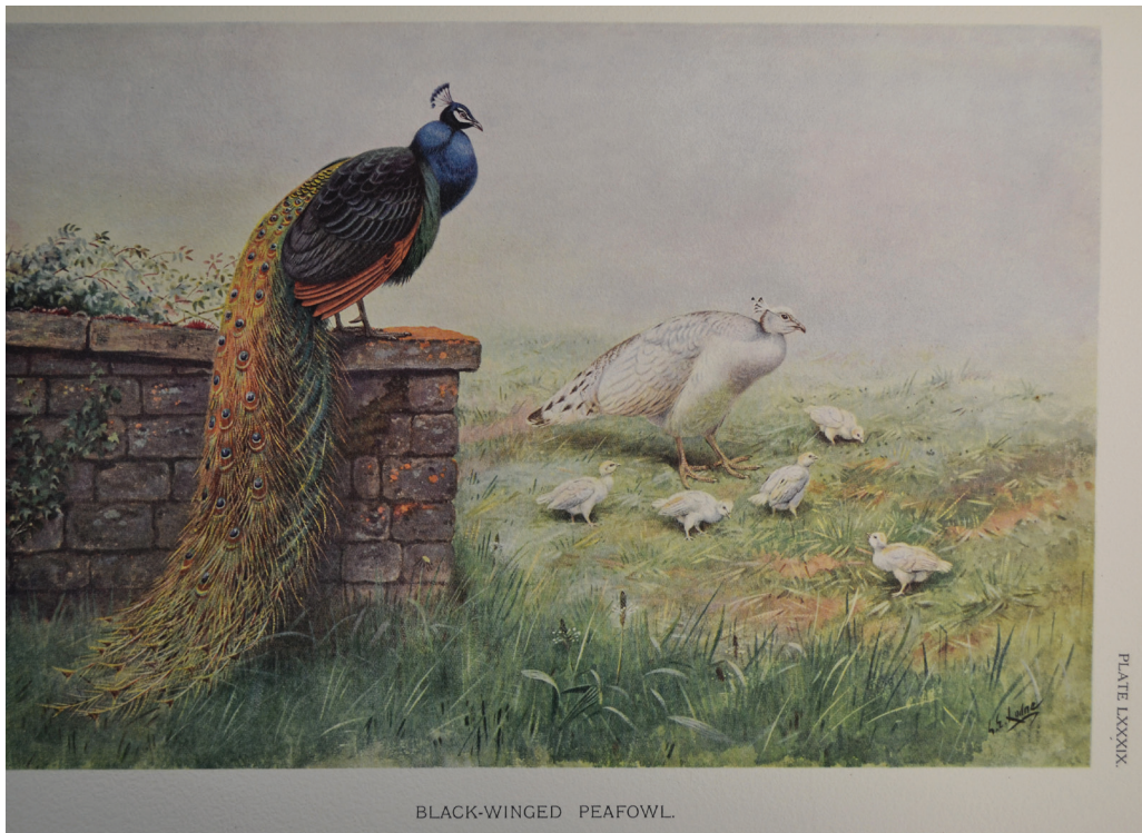
Figure 6. 'Black-winged Peafowl', pl. 89 in A monograph of the pheasants (Beebe 1922); the first depiction of the chicks of this mutation. Juvenile plumage in both sexes is like that of the adult female and therefore nearly white (Hein van Grouw, © Natural History Museum, London)