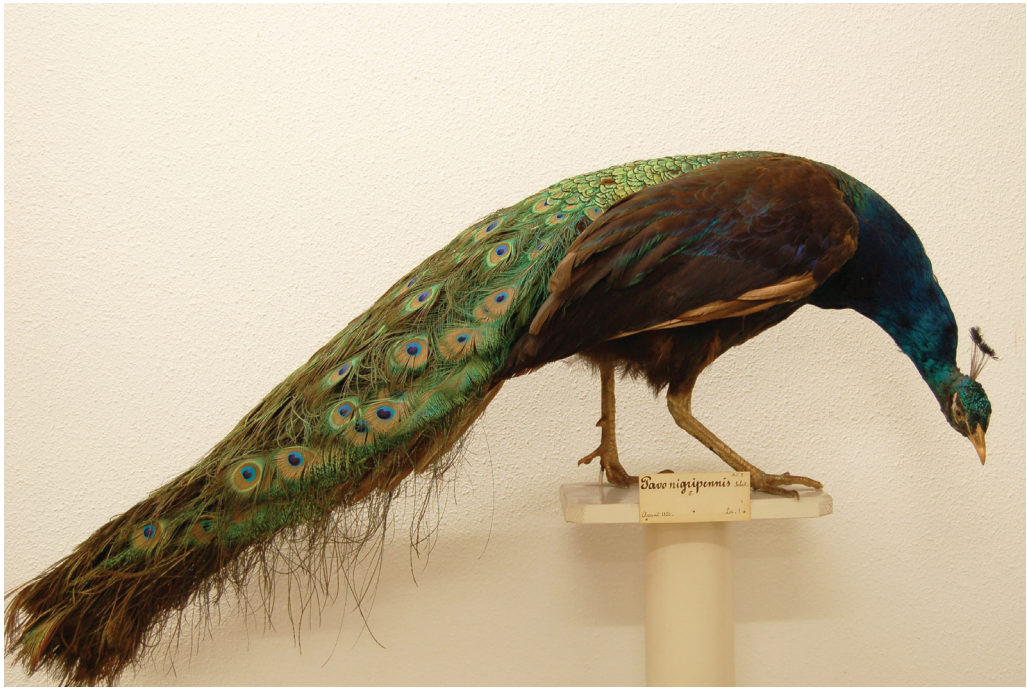
Figure 3. Black-shouldered Peafowl specimen from Temminck's collection, which was used as a model by Jean-Gabriel Prêtre (1768–1849) for his illustration (see Fig. 4), and is held at the Naturalis Biodiversity Center, RMNH.AVES.225015