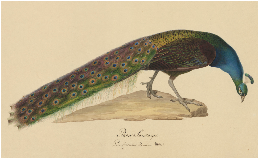
Figure 4. Watercolour of Black-shouldered Peacock specimen RMNH.AVES.225015 from Temminck's collection, painted by Prêtre but never printed. Temminck intended to publish an illustrated two-volume work in folio format on Galliformes, entitled Histoire naturelle générale des gallinacés . It was never published as it became financially impossible to produce such a luxury edition with the ending of Napoleon's reign (Brouwer 1953: 43).