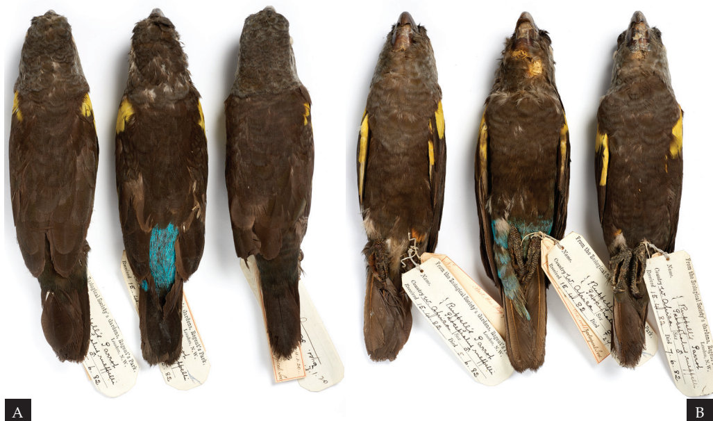
Figure 9. Three of the four specimens received alive at London Zoo in April 1882 and which died in June 1882, from left to right: male, NHMUK 1890.4.1.19; male, NHMUK 1890.4.1.20; female, NHMUK 1890.4.1.21