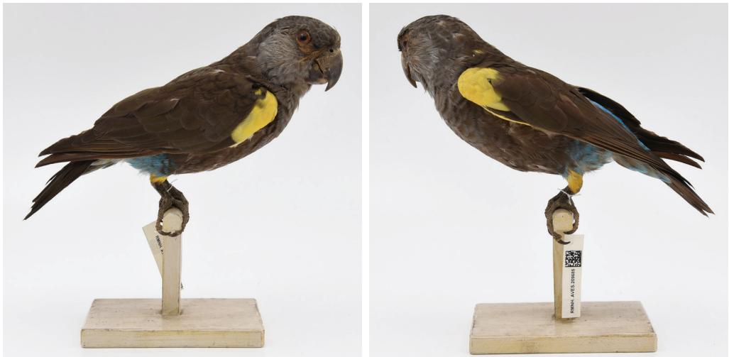
Figure 5. Specimen of nominate Rüppell's Parrot Poicephalus rueppellii from north Angola, in the Naturalis Biodiversity Center, RMNH.AVES.209654, which is smaller and overall darker but has the blue rump and belly paler than birds from south-west Angola and Namibia

description, does not mention 'river Nunez' as its provenance. Consequently, the epithet rueppellii must be assigned to the smaller, darker northern taxon, which as far as is known occurs only around the towns of Benguela and Luanda in Angola. As a result, we propose to restrict the type locality to 'Luanda', after the shared locality of the only two specimens at NHMUK with precise data in this respect (NHMUK 1911.12.18.146, St. Paul de Loanda,