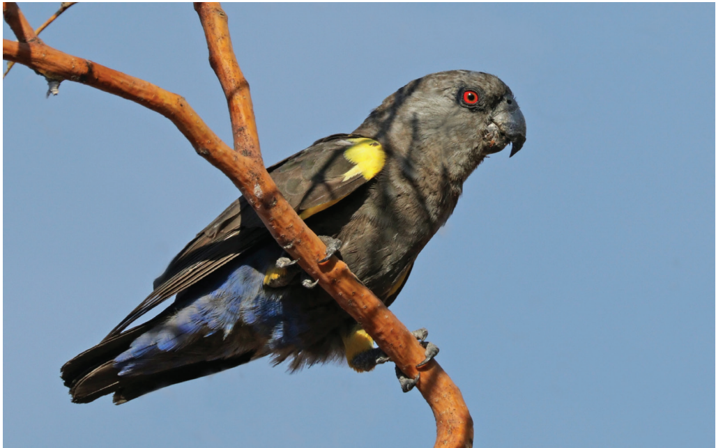
Figure 4. Female of the recently described Poicephalus rueppellii mariettae , Namibia, 4 March 2018; this taxon, with dark ultramarine-blue plumage in females, is better known and more widespread than the nominate subspecies