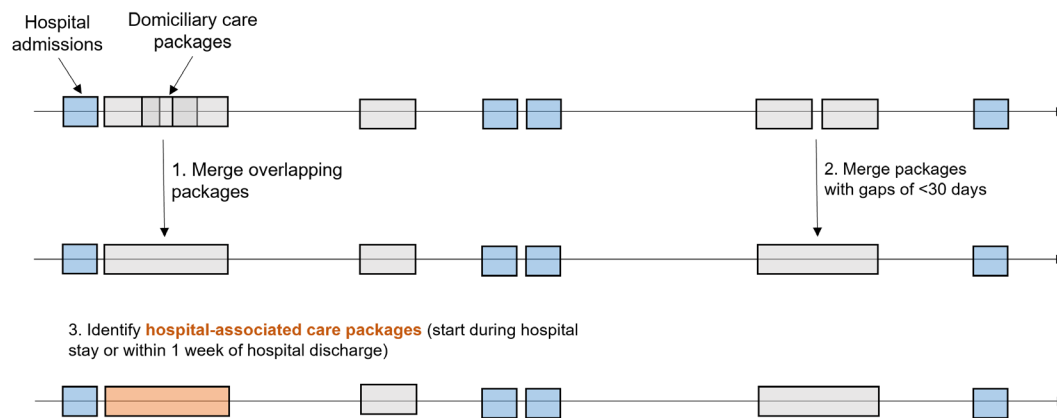
Figure 1 Processing of domiciliary care packages, and identification of hospital-associated domiciliary care packages.