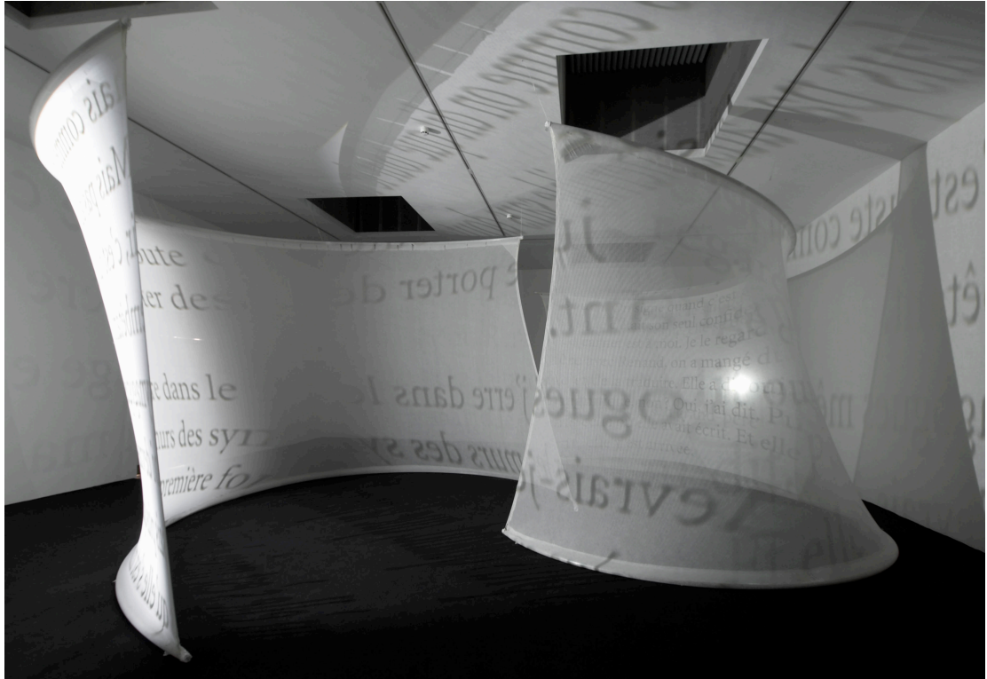
Figure 1 Marcher à côté de ses lacets dans un frigidaire vide (Chantal Akerman, 2004)

in on themselves, allowing the spectator to move with the shifting projected text, rather than to remain statically positioned in front of it. Movement around the spiral screen also permits a 'reading' of the screen – to chase after sections of text using a whole body, not just the eyes. The screens could also be regarded inattentively, as the words passed around and across the spectator's body and between the screens.