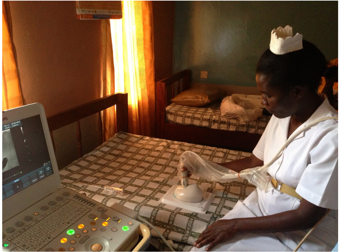
Figure 2. Ugandan sonographer undergoing ultrasound training on a breast phantom.

with a L12-4 MHz transducer. The sonographer used a standardized volumetric scanning protocol performed by sweeping the transducer over the entire palpable area, as described previously. Ultrasound data was managed via a PACS-compatible electronic medical records system, which enabled site data entry and remote database access. An American board-certified radiologist reviewed all images remotely in the United States and signed off on their interpretations using peerVue (peerVue, Inc., Sarastoa, FL, USA), a commercial Web-based system, for quality assurance. The sonographer communicated any changes in the interpretation to the patient.