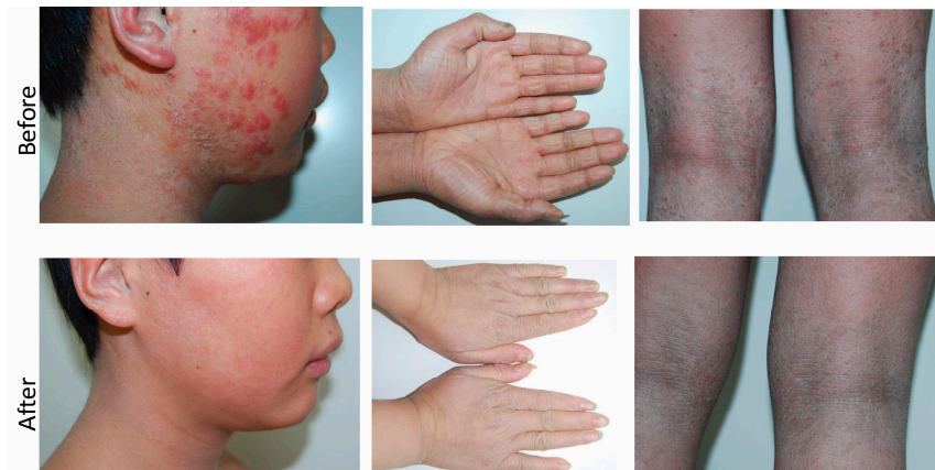
Figure 1. Clinical photos. Erythematous macules and papules involved the face and marked thick scaling of the bilateral palms and popliteal fossae before treatment ( upper row ); Dramatic resolution of the erythema as well as papules and pustules was observed after oral terbinafine treatment ( lower row ).

by the Beijing Genomics Institute at Shenzhen (BGI) to identify potentially clinically-relevant DNA sequence variants in specific targeted genes [8].