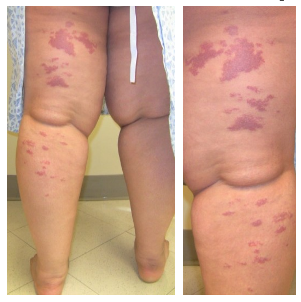
Figure 3: Vascular nevus . Flat patchy blanchable nevus (port-wine stain) distributed in S1 and S2 dermatomes.

charged home with unchanged spastic paralysis, incontinence, and anesthesia one year after admission. Cobb cited seven other cases, including the original dissertation by Berenbruch, where a vascular nevus occurred in the same metamere as an angioma of the spinal cord. The various presenting symptoms included weakness, paralysis, anesthesia, and pain, which were thought to be triggered by expansion or rupture of the angioma causing either direct compression of the cord or ischemia to the cord secondary to diverted blood flow. Cobb concluded that vascular nevi on the skin may be of diagnostic value when neurologic deficits corresponding to a