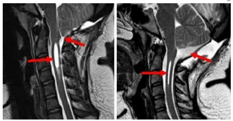
Figure 1: Chiari type I and syrinx pre-op (left) and post-op (right). T2-weighted images of cervical spine pre- and post-op demonstrate reduction in size of syrinx and decompression of posterior fossa and foramen magnum.

groin radiating down to the left leg as well as her bilateral soles. After a negative workup including multiple lumbar punctures, nerve conduction studies, electromyography, autoimmune panel, infectious serologies, and body imaging, she was referred to our clinic for management. A skin exam at the time revealed a flat and patchy blanchable rash (port-wine stain) in the S1 and S2 dermatomes in her left posterior thigh and calf, reminiscent of the cutaneous lesion in Cobb syndrome (Figure 3). Aside from her subjective sensory complaints, a neurological exam was unremarkable. An MRI and MRA with and without contrast of her lumbar spine demonstrated no evidence of a vascular abnormality in the spinal canal. Pre and post contrast MRA/MRV sequences utilizing 4d TRAK (time resolved angiography) and delayed MRV images were obtained. does not rule out subradiographic vascular malformations in the spinal canal or cauda equina as a potential explanation for her symptoms since it would be unusual for a treated Chiari malformation and cervical syrinx to involve the bladder and lower extremities. The patient currently returns to clinic every six months for follow-up. Her symp-