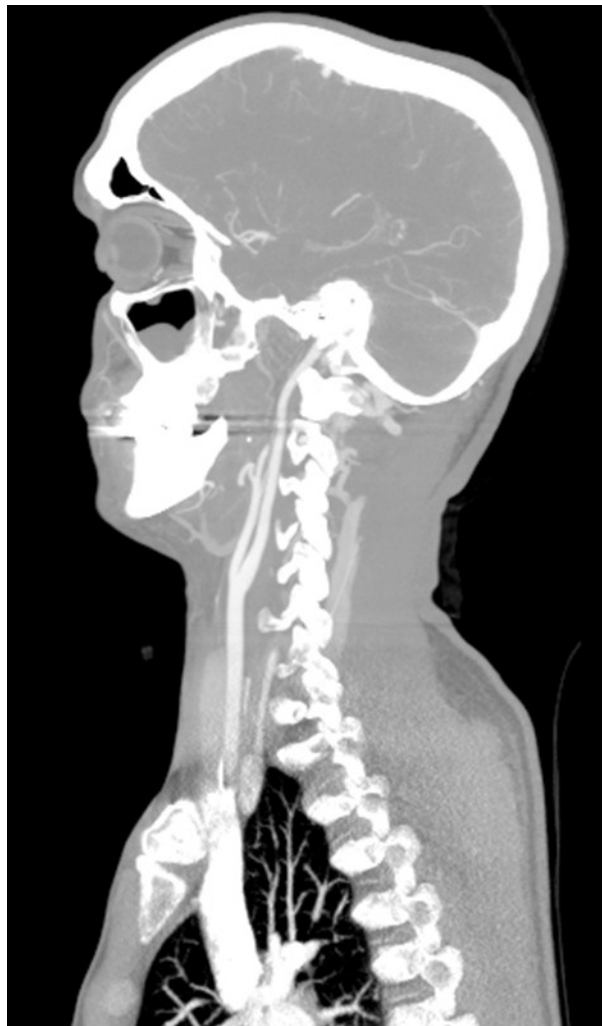
Figure 6: One year follow-up of right carotid artery showing resolving dissection.