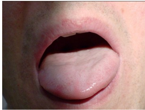
Figure 5: Three month followup of angioedema.