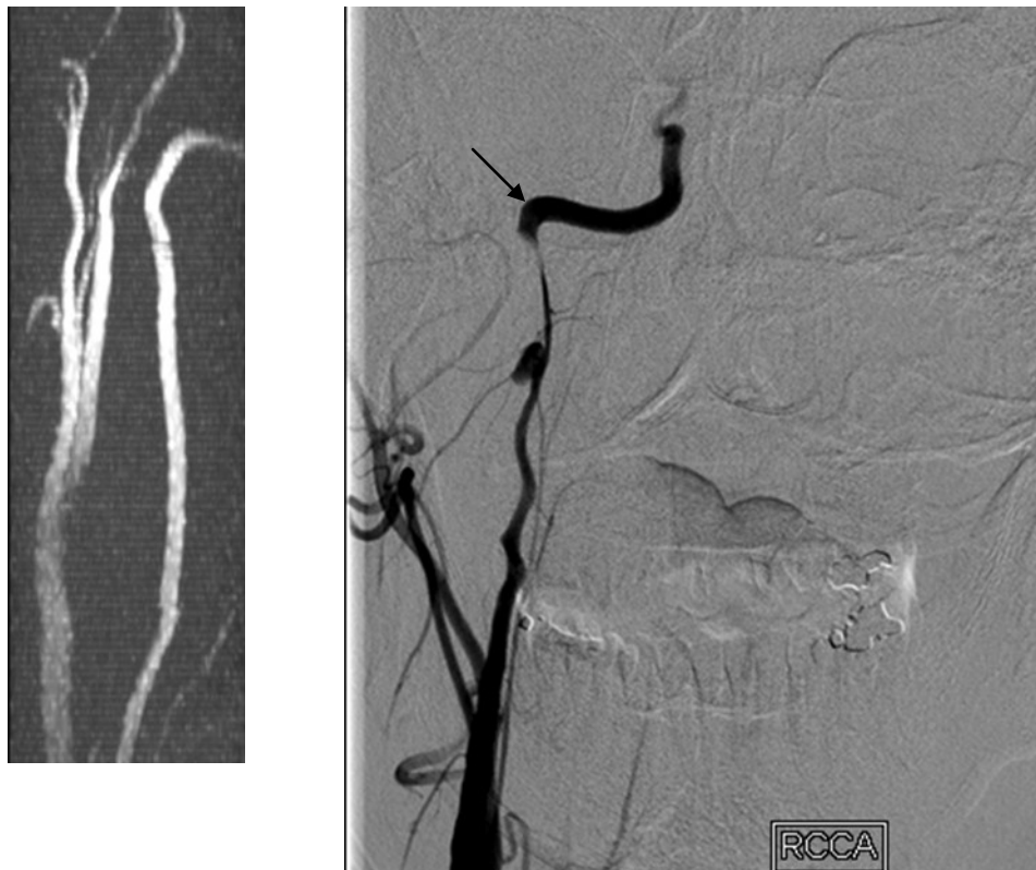
Figure 3 (left): MRA of right ICA dissection. Figure 4 (right): Angiogram AP view of right ICA dissection with pseudoaneurysm (arrow)