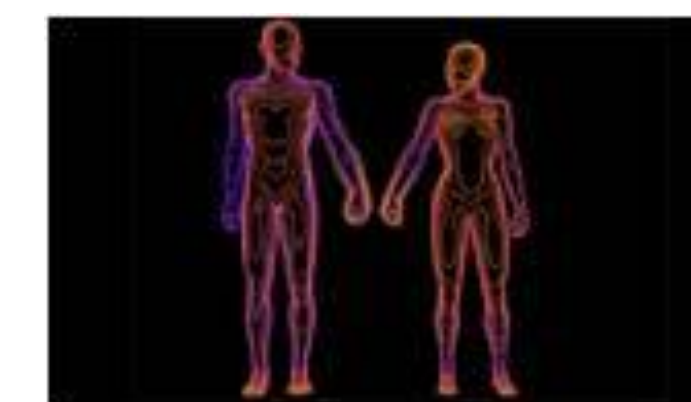
Photo from Office of Research on Women's Health, NIH. Public Domain.

https://sexandgendercourse.od.nih.gov/index.aspx