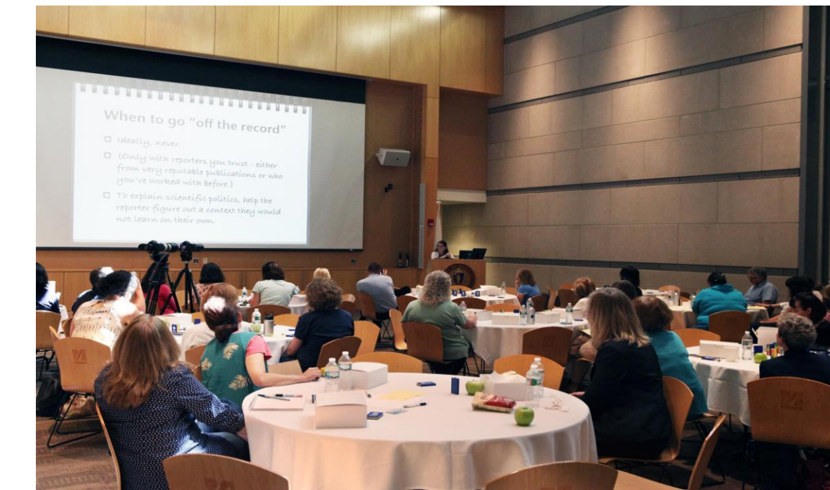
Event