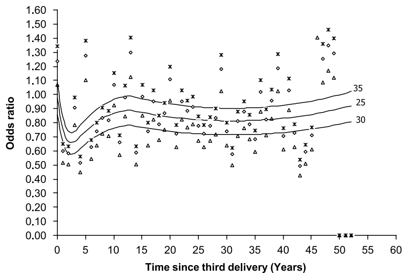
Figure 3. OR estimates associated with each year since third delivery for women who have three parities with age at third delivery of 25 years ( \diamond ), 30 years ( \triangle ), or 35 years ( \times ) compared with biparous women. Solid lines , fitted results from quadratic spline logistic regression. The quadratic spline logistic regression core model is \beta_0 + \beta_p (parity) + \beta_a (age) + \beta_{aafd} (age at first delivery) + \beta_{aasd} (age at second delivery) + \beta_{aatd} (age at third delivery) + \beta_1\chi_1 + \beta_2\chi_1^2 + \beta_3\chi_2^2 + \beta_4\chi_3^2 , where age, age at first delivery, and age at second delivery are one-year categorical time variables. \chi_1 is the continuous variable of years since second delivery. \chi_2 = \chi_1 - 3 if \chi_1 > 3 , otherwise \chi_2 = 0 . \chi_3 = \chi_1 - 14 if \chi_1 > 14 , otherwise \chi_3 = 0 . \beta_1 = -0.3159 , \beta_2 = 0.0628 , \beta_3 = -0.0660 , \beta_4 = 0.0035 .

Heuch et al. (16), categories of age, time since delivery, and age at delivery were set in broad ranges, necessitating additional assumption of homogeneity in relative risk estimates within levels of each variable (26). With the use of single-year indicator representation for age, age at delivery, and years since delivery, the refined model in our analysis did not impose a functional form for the effect of year since delivery and allowed the estimation of nonlinear effects of time since delivery. With the large quantity of data, we were able to estimate relative risk associated with each individual year after delivery while controlling for current age and age at first birth also in single-year-indicator representation.