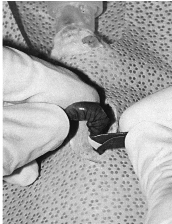
FIG. 4. Cecal.