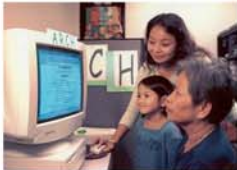
Massachusetts General Hospital Access to Resources for Community Health (ARCH)