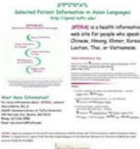
Tufts University Selected Patient Information Resources in Asian Languages (SPIRAL)

CONNECTICUT Membership: 38 full members; 48 affiliate members