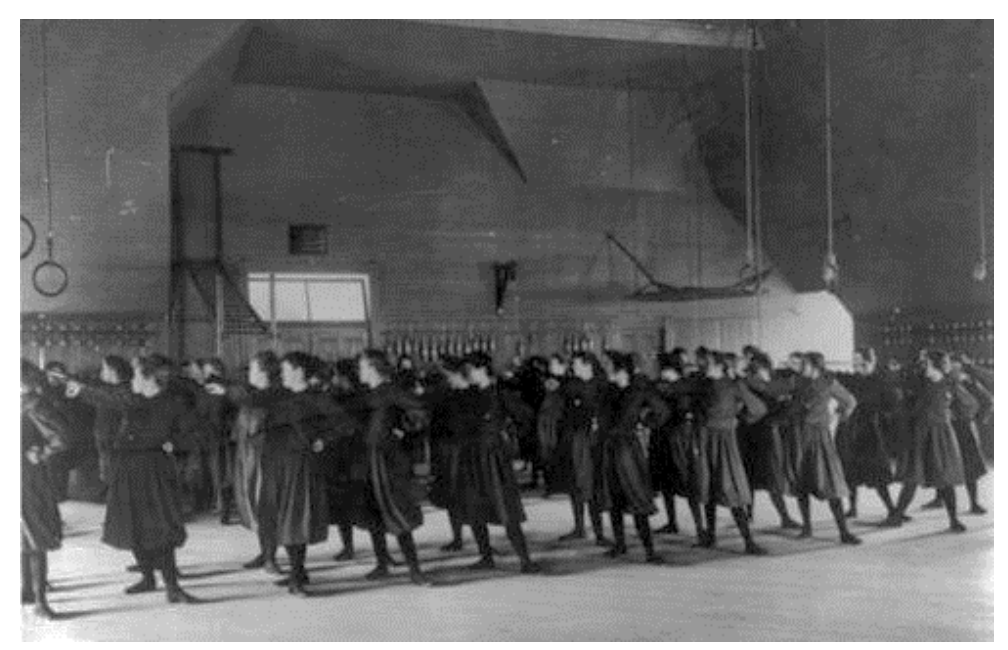
Physical Culture Class, 1903

In Senior Gymnastics, the second year, women were "to acquire elasticity, poise, grace, and ease of manner" (ACU Catalog, 1902, p. 123). The class was to include French fencing, basketball, and tennis.