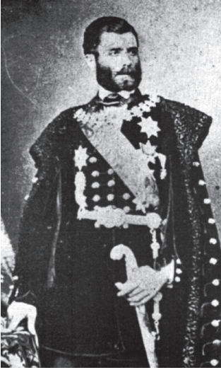
Figure 5. Prince Michael Obrenović

lead of those who make it rain and shine,” Rosen reported the Prince as saying. Michael clearly had not completely abandoned his thoughts of a Balkan uprising and attack on the Ottoman Empire, despite the negative policies he had pursued in this regard since meeting Andrassy at Ivánka in August 1867. He was as convinced as ever that “Attempts at reform are not going to solve the Eastern Question.” The deciding factor in his mind seems to have been the possibility of Prussian support against Austro-Hungarian intervention, as well as the fact that nothing concrete had come of Andrassy’s promises at Ivánka. 59