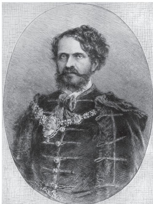
Figure 3. Count Gyula Andrassy

By 1867, Andrassy was, more than ever, obsessed with the danger to Hungary from Pan-