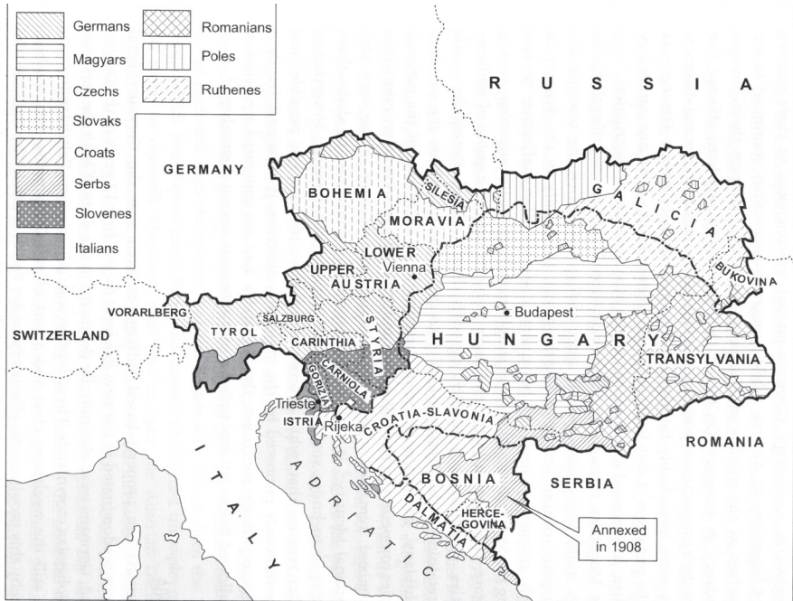
Map 2. Nationalities of the Habsburg Monarchy

The Austrian Statute 146 of 21 December 1867, by contrast, made no mention of the common foreign minister's obligation to consult with the ministries of the two halves of the Monarchy. Article 1(a) stated to be "common"