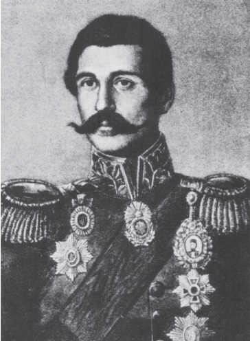
Figure 7. Prince Alexander Karađorđević

contrary to the natural tendency of Serbian national feeling.