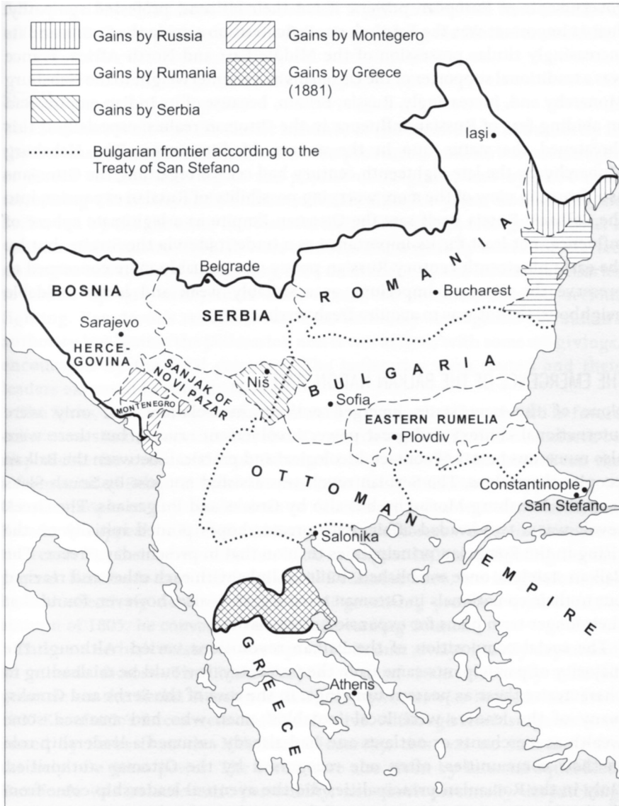
Map 7. The Balkans after the Congress of Berlin, 1878

Constantinople within three years. For the detailed discussion of these instruments, Ristić was referred to the foreign ministry's expert in such matters, Baron Schwegel, the next day. 2