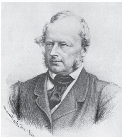
Figure 2. Count Friedrich Ferdinand von Beust

It was essential, therefore, to forestall an explosion by improving the lot of the Balkan Christian