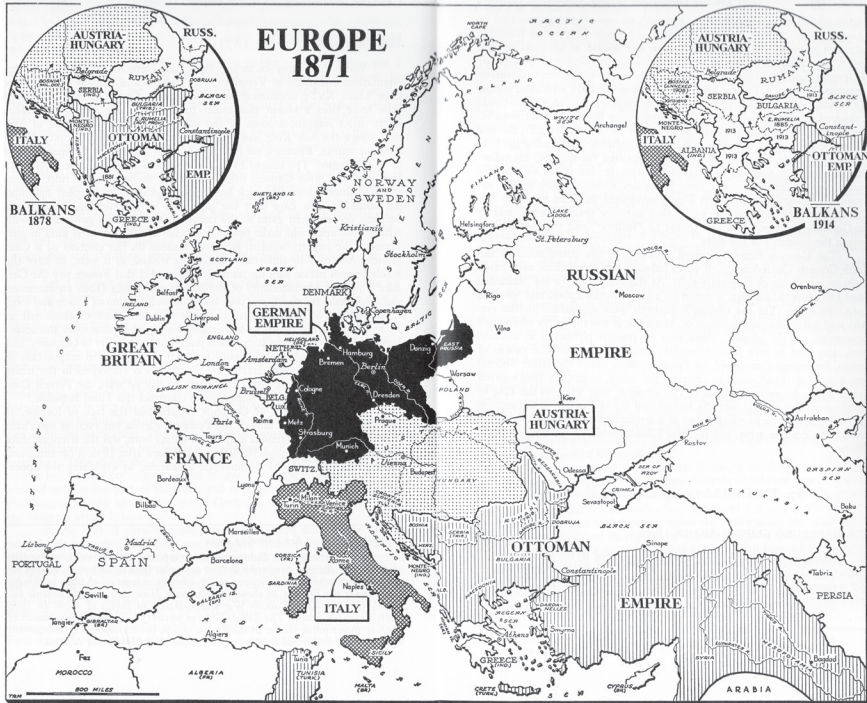
Map 5. Europe at the Conclusion of the Franco-Prussian War, 1871

It was in their reasons for accepting the idea of a war in the East, predictably, that Beust and Andrassy really differed. Andrassy saw it as an end in itself, an essential defensive measure to remove a standing threat to the Monarchy's, and Hungary's, security. Beust, by contrast, had his sights fixed firmly in both directions: the Monarchy had the chance both to reorder Germany more to its liking, and at the same time to solve the Eastern Question. 3