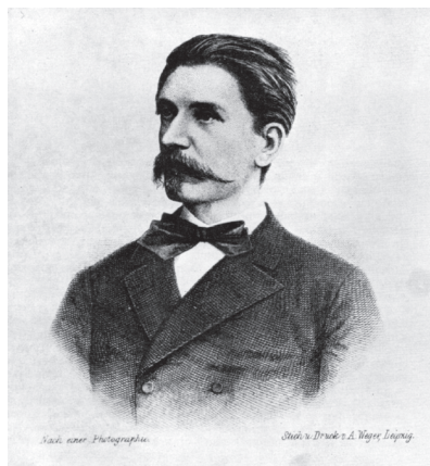
Figure 4. Benjámín Kállay

The man thus elevated to one of the most sensitive postings in the Austro-Hungarian diplomatic service was not yet twenty-nine years old. Kállay was born in Pest on 22 December 1839, the son of the successful administrator István Kállay, who died when Benjámín was only five, and Amália Blaskovich. On his father's side Kállay more than met the requirement of noble blood, since the Kállays were one of the oldest noble families in Hungary. 8 The family was, however, comparatively