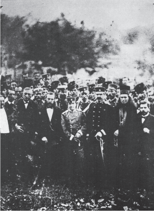
Figure 6. Prince Milan Obrenović with Regents Jovan Ristić and Milivoj Blaznavac, 23 June 1868

opposed to Russian influence in Serbia. The proclamation of allegiance to Milan, whose title to succeed was unimpeachable, thus shrewdly steered around the threat of a Russophile head of state, and at the same time put Blaznavac in a position to influence affairs during the inevitable period of minority rule. 8