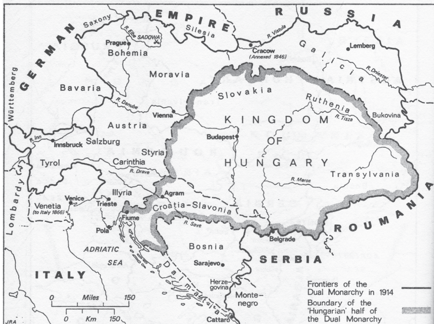
Map 1. The Dual Monarchy of Austria-Hungary after 1867

strictly speaking there was no text of the Settlement: “Dualism is regulated by two laws, analogous or identical in content.” 1 The Hungarian Law XII of 1867, as the senior of these two laws by some six months, deserves to be regarded as the original version, the model of the subsequent Austrian law, and, on the subject of foreign affairs, the more unambiguous. Paragraph 8 stated that