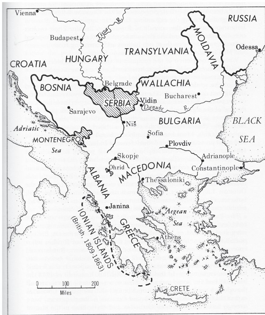
Map 3. The Balkans in 1815

war of liberation on behalf of the Balkan Christians; and Zastava was among the bitterest of these critics. There was considerable injustice in this: Michael was only too aware that Serbia's real military potential was far less than its strength on paper would suggest. None of this, however, was known outside of Serbian government circles, and the problem was compounded by the events of 1867, when the Prince, at the very time the Hungarian government was abandoning its Serb minority, showed every sign of having done a deal with Budapest. The Vojvodina became, more than ever, the center of agitation against the Serbian government. 70