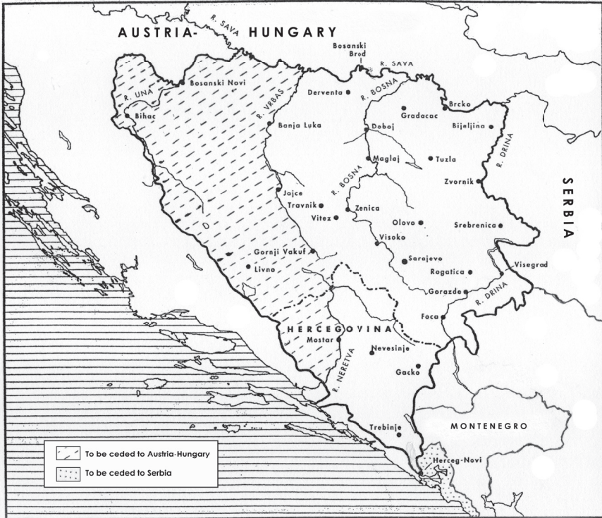
Map 6. Plan for the Partition of Bosnia-Hercegovina, 1870–71

terview, which he wrote down in French at the time and, according to his own account, “in his [Kállay’s] presence, [and] at his dictation.” 46 In their published, Serbian form these notes differ from the French notes taken at the time only in minor details. The sole significant inaccuracy is that Ristić in his memoirs describes the interview as having taken place in the autumn of 1870, an error repeated by Vojislav J. Vučković when he published the French text in 1963. 47 The Kállay diary, however, makes it clear that the only draft treaty set down on paper in this fashion, between Kállay and the Regents, was that discussed on 27 December. 48 It also seems probable, in the light of the above evidence, that what Kállay read out to Ristić was the final form of the list he submitted to Andrassy in Pest on 11 December.