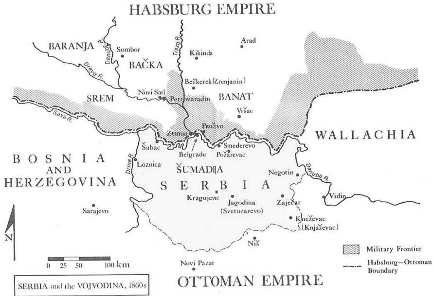
Map 4. Serbia and the Vojvodina, 1860s

fitted tidily into the Habsburg Monarchy a score of times. Its population still numbered only a million, the vast majority of whom made their living off the land in a country with virtually no modern infrastructure. 71 Its official military strength was a sham, rather like the frog that inflates itself to twice its size to impress its enemies. Though autonomous, its Prince was still a vassal of the Sultan.