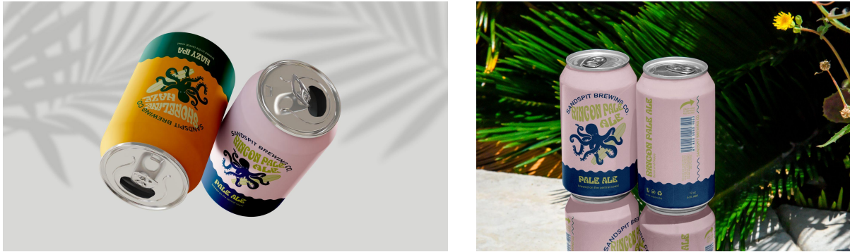
Figure 3: Mockups

During this stage, I got lots of good feedback regarding the color combinations I was trying out as well as stylistic choices regarding my text design and other details. For this project, I used Illustrator to create my graphics and labels and Photoshop to make my mockups.