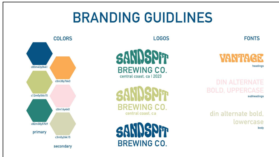
Figure 1: Brand Guidelines

Although I created the brand guidelines early on in the process, I definitely continued to edit and revise it as I got further along in the design process. However, starting with these items was very useful when it came to designing the can labels themselves in terms of having a starting point. From here, I definitely had lots and lots of revisions when it came to word placements, color combinations, etc. as well as altering the scope of my project slightly too.