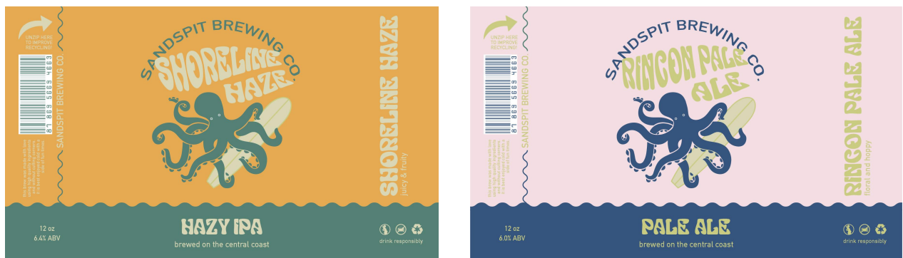
Figure 2: Can labels

Although I created the brand guidelines early on in the process, I definitely continued to edit and revise it as I got further along in the design process. However, starting with these items was very useful when it came to designing the can labels themselves in terms of having a starting point. From here, I definitely had lots and lots of revisions when it came to word placements, color combinations, etc. as well as altering the scope of my project slightly too.