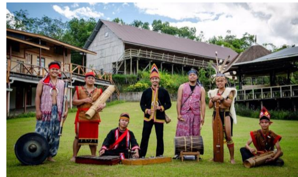
Music band of Suk Binie'

Some of the practices were faced with many challenges to the point that some community members have given up. Nevertheless, what should be remembered is that the use of Bidayuh exists beyond the classroom setting; it plays a significant role in social and cultural sustainability. The process is multigenerational and may develop as time goes by with bigger and more ambitious goals.