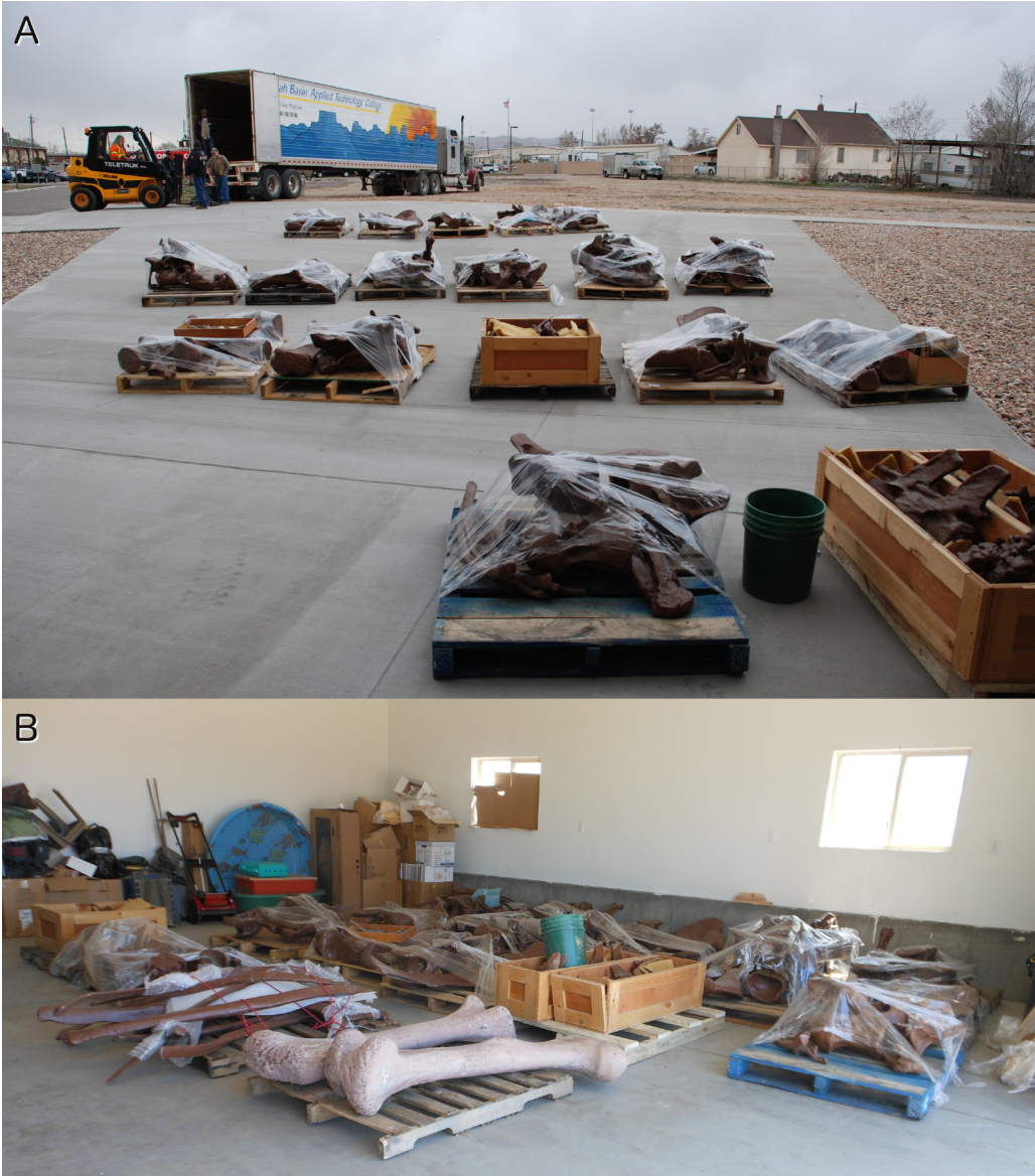
Figure 11. The elements of the concrete cast moving from Vernal to Price, Utah, on April 8, 2013. (A) The concrete cast packed onto wooden pallets outside the new Field House building, having been prepared for transportation to the Utah State University Eastern campus in Price, about 100 miles southwest of Vernal. (B) The same bones having been unpacked into Ken Carpenter's garage in Price, Utah.

cause that is where the city holds outdoor events, and no room on the north side because of the parking lot and overhead main power line for downtown businesses. The intention was that the cast would be mounted outside a new museum in Price, which was then in the planning and fund-raising stage. However, due to funding difficulties this museum was never built and the land that had been donated for the museum was returned to the donor. In light of these developments, Carpenter discussed with the USU chancellor the possibility of temporarily mounting the skeleton on campus. However, this idea was not implemented since Carpenter feared that mounting and later dismantling the cast to move it to a new museum would damage it. Therefore,