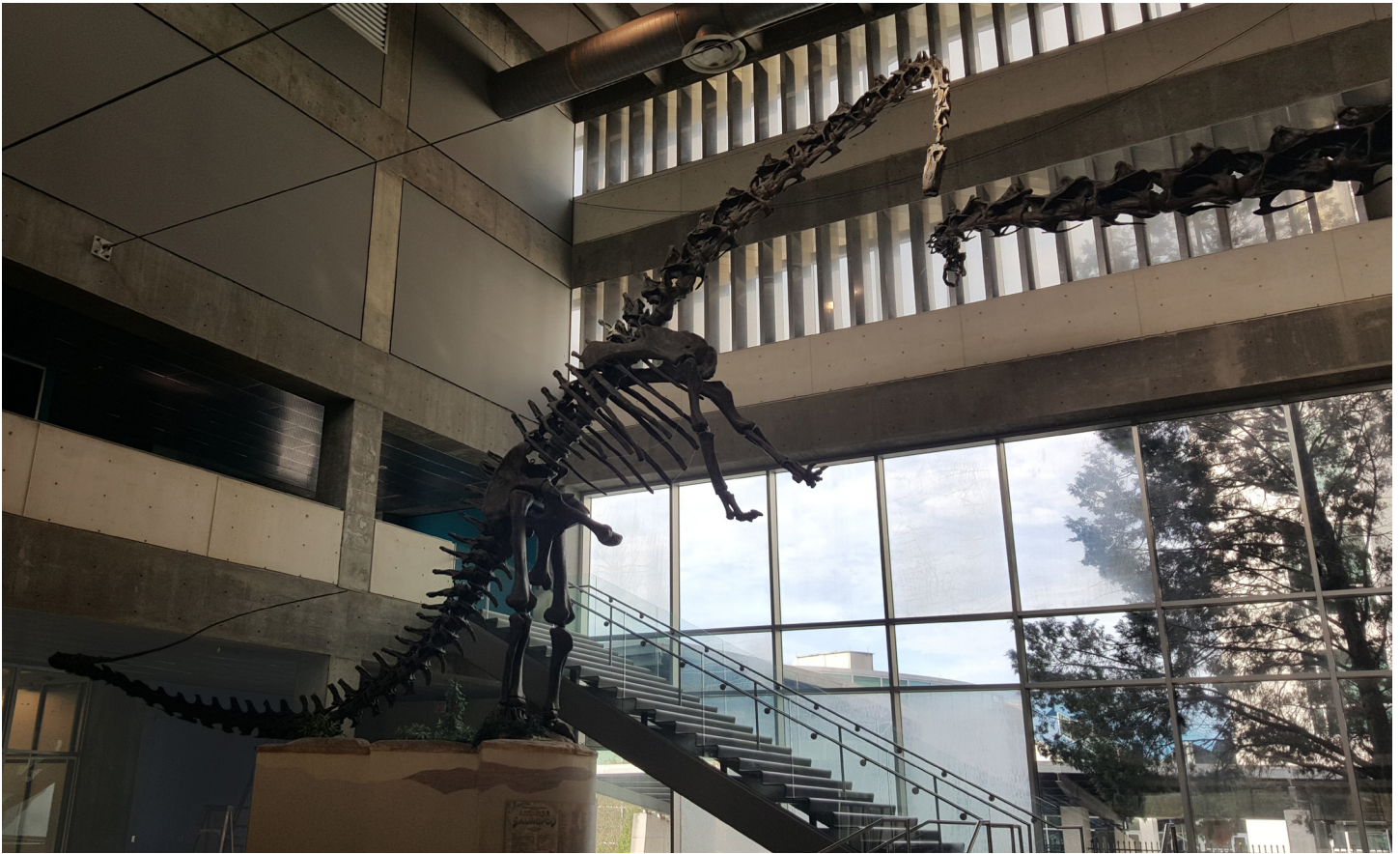
Figure 10. Double Diplodocus mount at the Museum of Science and Industry (MOSI), Tampa, Florida. Both individuals are identical, having been cast from the molds made by Dinolab from the concrete Diplodocus of Vernal. Photograph by Anthony Pelaez, taken between 1997 and 2017.

gested posting a news article requesting the return of the bones, and the workman came forward with them enabling the femora to be reunited with the rest of the concrete skeleton.