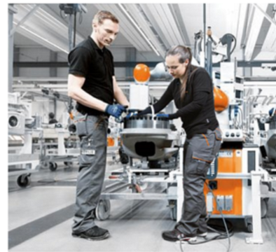
Figure 1: A collaborative robot is assisting two human users working concurrently on a manufacturing object (adapted from [9]).

Proc. of the 22nd International Conference on Autonomous Agents and Multiagent Systems (AAMAS 2023) , A. Ricci, W. Yeoh, N. Agmon, B. An (eds.), May 29 – June 2, 2023, London, United Kingdom. © 2023 International Foundation for Autonomous Agents and Multiagent Systems (www.ifaamas.org). All rights reserved.