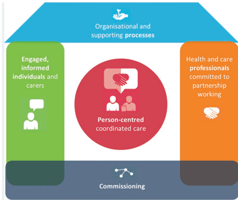
Figure 1 The House of Care model. [23]

within the National Institute for Health Research (NIHR) Yorkshire and Humber Patient Safety Translational Research Centre.