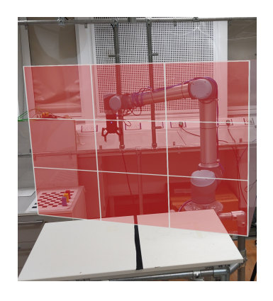
Figure 2: Large cube with thin opaque bars