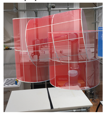
Figure 3: Large cylinders with thin opaque bars

• Large cylinders: Cylinders around the three main parts of the robot arm. These are sized according to the ISO 15066 standard and do not change in size dynamically. The radius of the cylinders is larger than for the small cylinders since it also includes compensation for hardware and network latencies.