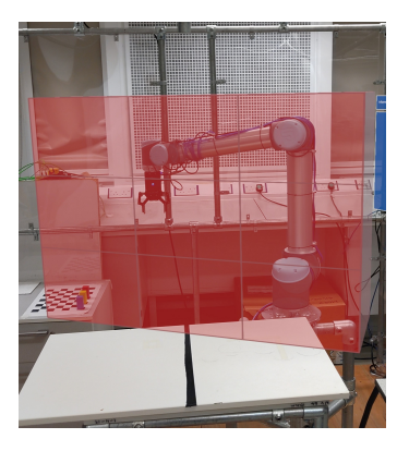
Figure 4: Small cube with thin transparent bars

Each participant completed a questionnaire at the end of their participation. A five-point Likert scale (strongly disagree, disagree, neither agree nor disagree, agree, strongly agree) was used for the questionnaire, and users were asked to explain their preferences in short paragraphs for each specific answer. The questions for phases 1 and 2 are given in table 2. For phase 2, the preamble to the questions and the questions on visualisation (Q7a and Q7b) were altered to mention the virtual cage bars for the four configurations. (We decided to label the semi-transparent bars in phase 2 as translucent/half-transparent so as to make the differ-