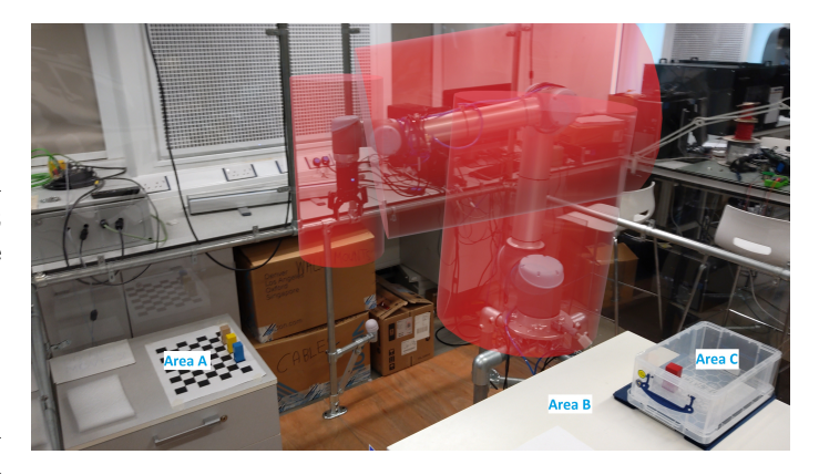
Figure 1: The robot arm picks up a wooden block from area A and moves it to area B, the middle of the table. The user then picks up the block from B and places it in the plastic container (area C).

The aim of the study was to compare alternative ways to display the shape, size, and appearance of a virtual cage around a robot arm in a collaborative pick-and-place task and consider how this influences perceptions of safety.