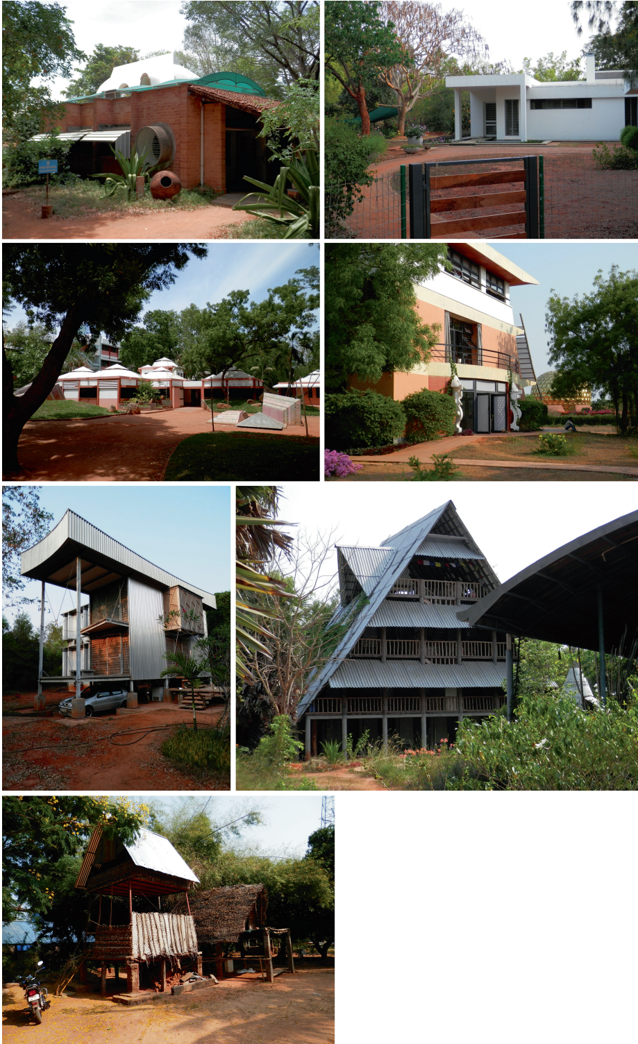
FIGURE 4 Some of the diverse architectural styles in Auroville