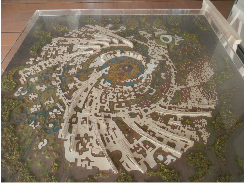
FIGURE 2 Model of the Galaxy Plan, Auroville Visitor Centre

architect Roger Anger submitted his plan for the township; a plan that became known as ‘The Galaxy Plan’ (Figure 2) because of its visual resemblance to a galactic constellation. It was an abstract design for a model community, which in its formative years and at this very early stage aimed at being what its prospective founders variously referred to as a ‘city of human unity’, a ‘spiritual city’, ‘universal township’, and ‘city of the future’. This galaxy-shaped design would have four zones, each spiralling out from the geographic centre: a cultural zone, an industrial zone, an international zone, and a residential zone, the whole area of Auroville being some twenty kilometres squared, with an urban centre occupying two square kilometres. The Galaxy Plan was accepted by The Mother and the ceremony described at the beginning of this article marked the city’s formal opening. Central to the township is its charter, which from its inception has provided the settlement’s guiding constitutional principles. It states that: