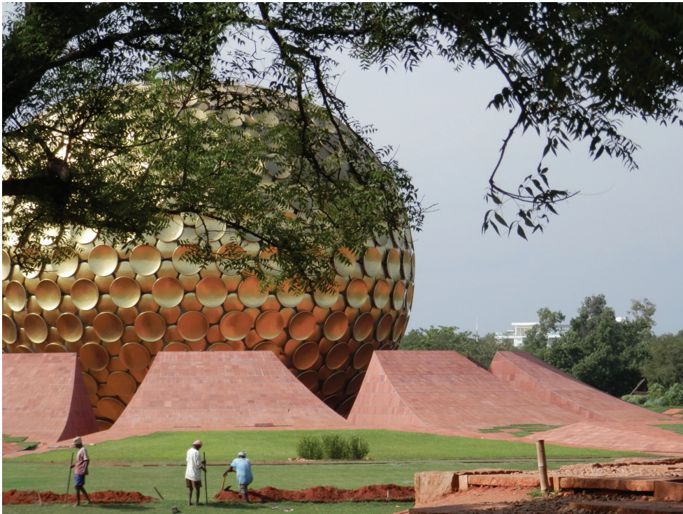
FIGURE 3 The Matrimandir, Auroville

As well as these municipal institutions, Auroville contains just over 100 settlement buildings, including houses and apartment blocks. These are built in a wide variety of mostly modernist architectural styles (see Figure 4). There is no characteristically ‘Aurovillian’ style of architectural modernism. Rather, in keeping with the idea of an avowedly experimental city, the township contains a variety of architecture and forms of regional architectural innovation, including earth architecture and other sustainable forms of building, brutalist inspired concrete architecture, minimalism and rendered ‘California-style’ houses, French-inspired international modernism, inside-out critical regional styles more reminiscent of Sri Lankan or Balinese tropical modernism, and abstract and spiritual modernism. Indeed, Auroville is known throughout India for its richness of architectural diversity and experimentation. It is home to some world leaders in certain aspects of sustainable architecture, for example, the architect known as Satprem is considered one of the world’s leading earth architects. The township also has a very dense concentration of architects amongst its population: around 1 in every 80–90 people is a professional architect, and many more are self-builders. This is the kind of place to which Indian architecture schools regularly make field trips.