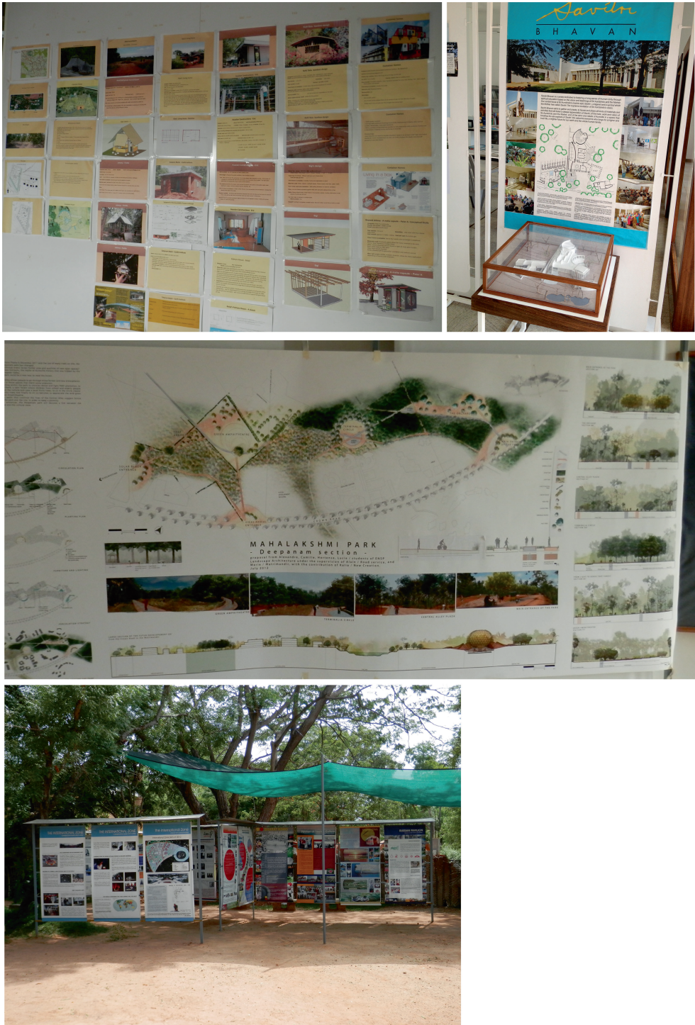
FIGURE 5 Architectural drawings, plans and models on display across Auroville