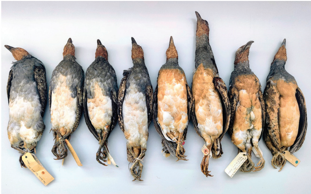
Figure 1. Comparison of four specimens of Dulit Partridge Rhizothera dulitensis (left) with four Long-billed Partridges R. longirostris (right) at the Natural History Museum, Tring (NHMUK), from left to right: dulitensis NHMUK 1894.8.2.1, 1900.2.14.40, 1900.2.14.41, 1969.32.2; longirostris 1924.4.18.4, 1904.5.30.3, 1889.5.13, 1901.5.1.2