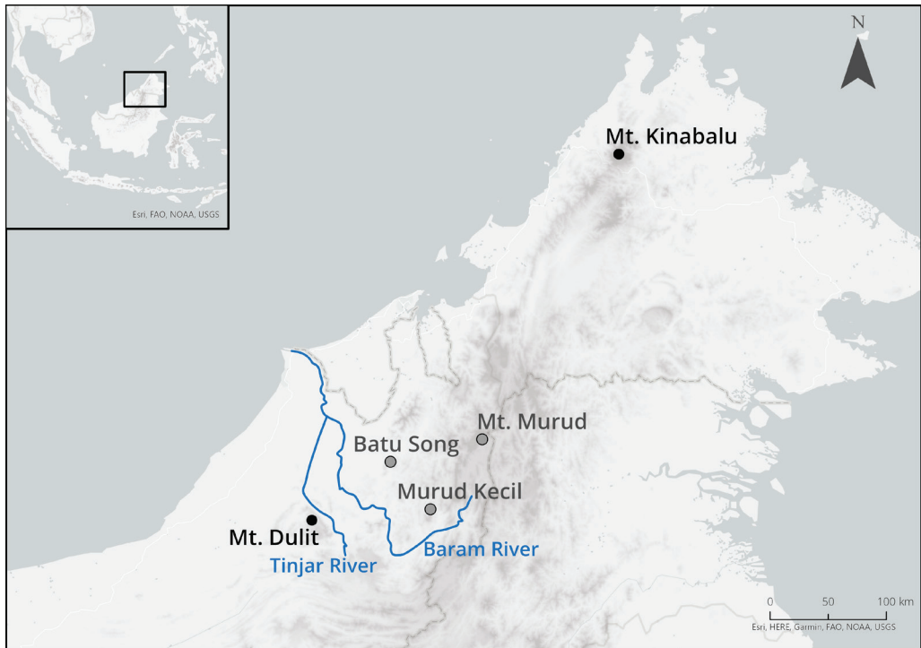
Figure 2. Sites and landmarks mentioned in the text. Black text = confirmed localities of Dulit Partridge Rhizothera dulitensis , grey = unconfirmed.