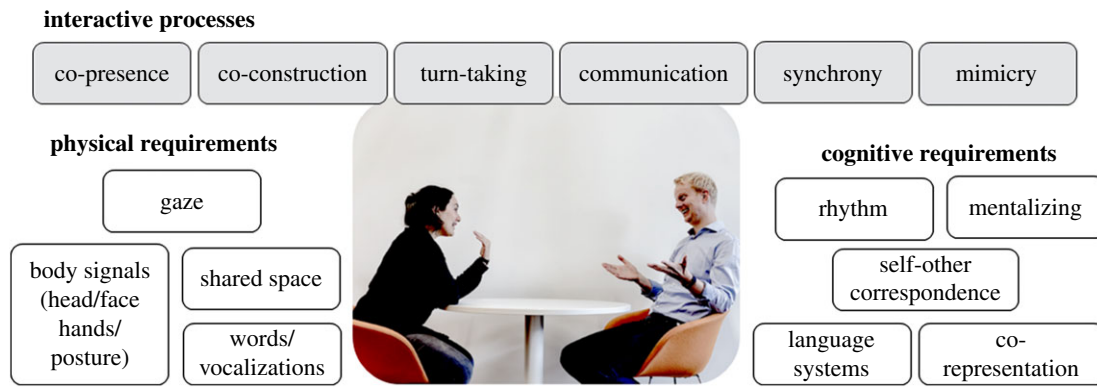
Figure 1. Building blocks of face-to-face interaction. Here we give examples of some interactive processes which cannot be fully studied in solitary individuals; this is not an exhaustive list but summarizes the processes examined in this special issue. For these processes to work, there are particular physical requirements in terms of shared spaces and the use of particular effectors; there are also particular cognitive requirements—processes that have been studied individually but which make a particular contribution or may be engaged differently in interaction.

interact as well as a shared physical (or virtual) space. Delineating the physical requirements of interactions may help us categorize and understand them. Interactive processes also have particular cognitive requirements—there may be basic types of cognition which are essential to interaction, and the figure shows some possible examples. Again, delineating which processes contribute to which interactions will be important in understanding if and how interaction builds on simpler cognitive systems.