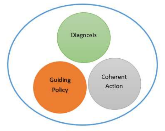
Fig.1: Rumelt Strategy Kernel

of Good Strategy, Bad Strategy and why it matters will be examined. A good strategy is a coherent mix of policy and action designed to surmount a high stakes challenge ([Rumelt, 2011). We can juxtapose from the definition of good strategy put forward by Rumelt that any organization that tends to explore the huge benefits of corporate communication must be prepared to act on the action and policy statements put forward by the corporate communication officers or experts. According to Rumelt, a good strategy has three clear cut elements that should necessarily and ordinarily bring about the surmount-able ability of corporate communication in terms of any challenge occasioned by an organization. It is pertinent to state that corporate communication is very crucial to resolving perturbed challenges facing an organization. These elements are diagnosis, guiding policy and coherent actions. According to Rumelt, diagnosis defines or explains the nature of the challenge; guiding policy provides the platform to cope with or overcome the obstacles identified in the diagnosis while coherent actions are the steps or actions that are worked upon together as a team in accomplishing the guiding policy (Rumelt, 2011).