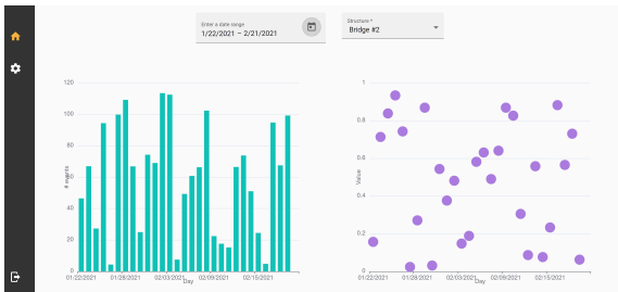
Fig. 3. The web dashboard of the SSC client application.

The client application is a Web dashboard (DApp), whose goal is to retrieve and visualize the SHM data stored in the Blockchain. More in detail, the application allows the user to specify the network type, the SSC address, and the endpoint of the chain from the settings page. Then, it automatically connects to the chain and gets ready for reading the anomalous