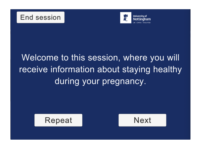
Figure 2: ALTCAI's participant's interface in text based modality.

2.1.1 The participant's interface. The participant's interface has two modalities: 1) Virtual-human based, 2) Text based. Both modalities use a Text-To-Speech (TTS) engine to produce synthesised speech, and offer the participants the opportunity to interact with it through speech too. The controller—i.e. the wizard—can chose which interface is presented to the participant.