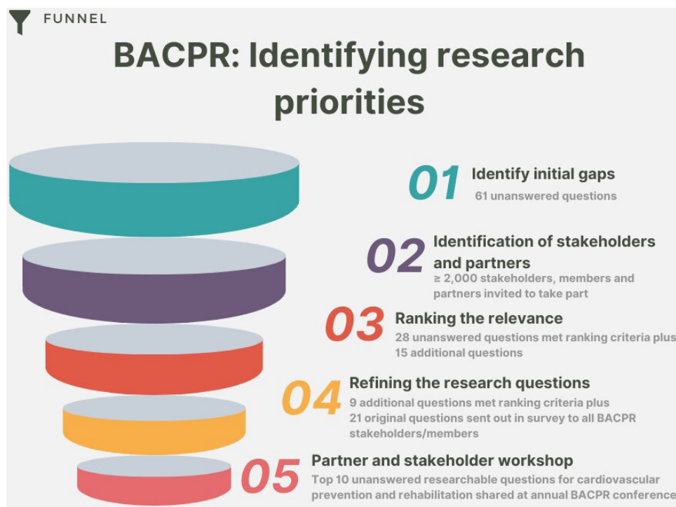
Figure 1 Summary of the findings from the five-step process. BACPR, British Association for Cardiovascular Prevention and Rehabilitation.

After refinement of these questions, a total of 30 questions (online supplemental appendix 2) were carried