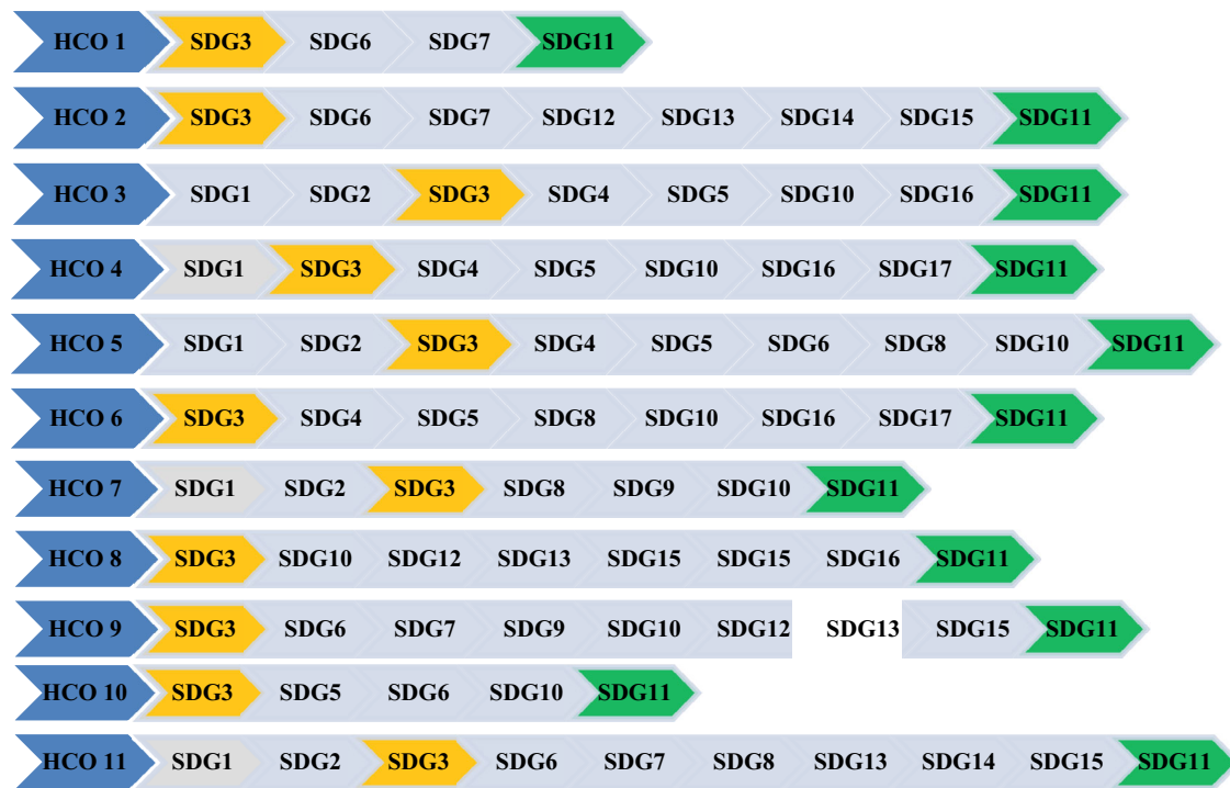
FIGURE 1 Actions to address the 11 Healthy City Objectives (HCOs) serve most of the 17 Sustainable Development Goals (SDGs) (Authors) [Colour figure can be viewed at wileyonlinelibrary.com ]