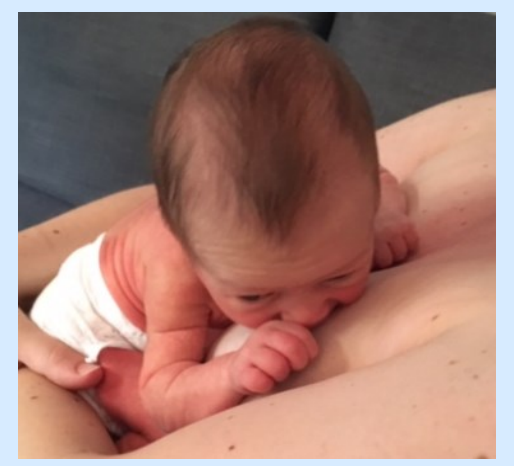
Baby roots, explores and sucks at their hand and the breast