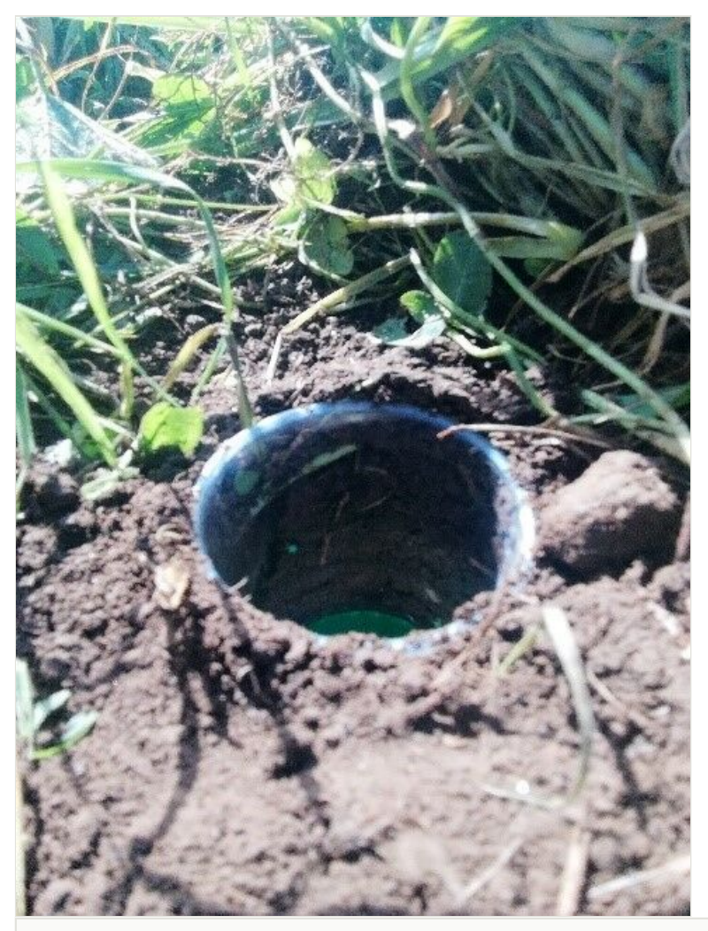
Figure 2. doi A pitfall trap. The trap was then covered with a plastic dish raised from the ground to avoid overflow of the trap due to eventual rainfall.

Quality control: After collection, specimens were stored in ethanol (96%) before sorting. Specimens, adults and juveniles, were identified in the laboratory by a trained parataxonomist (Sophie Wallon) and organised following a system of morphospecies (Oliver and Beattie 1996). Final identification was done by the senior author (Paulo A.V. Borges).