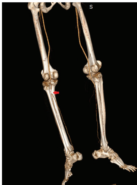
Figure 1. Computed tomography angiography of the lower limb of case number 2 reveals that the left proximal anterior tibial artery is partially occluded (red arrow).

In this case series, two patients underwent revascularisation surgery, and both had successful limb salvage. These were case numbers 2 and 6, respectively, as listed in Table 1; of them, catheter-directed thrombolysis and brachial embolectomy were performed ( Figures 1–3 ).