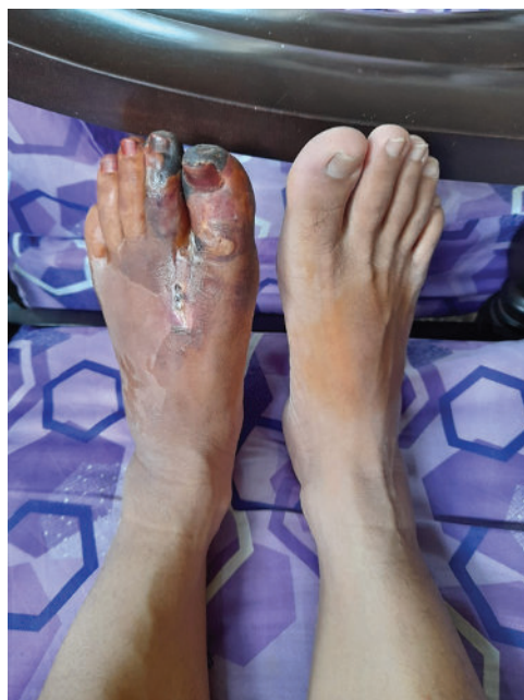
Figure 3. Left toe tip gangrene demarcated 1 month post-thrombolysis of the anterior tibial artery in case number 2.

Both case numbers 2 and 6 were in the younger age group of early 40s with a good premorbid