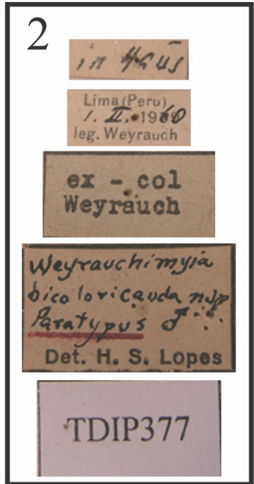
Figure 1. Labels of Mydaea latomensis (Muscidae). Figure 2. Labels of Weyrauchimyia bicoloricauda (Sarcophagidae).