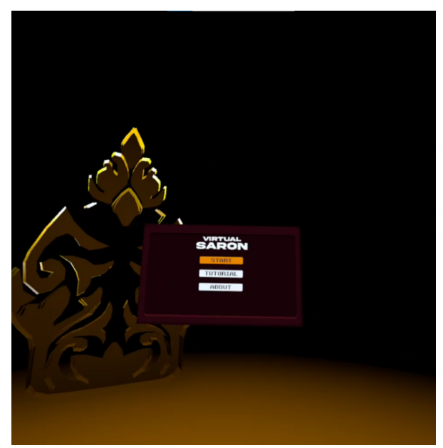
Figure 3. Main Menu on VR Gamelan Saron

Figure 3 shows that the VR gamelan Saron application has a main menu display that contains the "Start," "Tutorial," and "About" menus. The test plan ensures the system functions and runs as planned, as shown in Table 3. For example, when pressing the "Start" menu, the player will switch from the main menu to the gamelan Saron environment. When the player selects the "tutorial" menu, the player will be faced with a tutorial menu containing pictures and descriptions of how to play the VR gamelan Saron application. When selecting the "About" menu, a menu will be displayed, including the names of VR gamelan Saron developers.