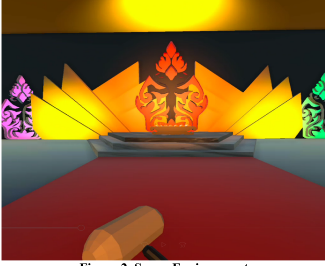
Figure 2. Saron Environment

Figure 2 shows that the VR gamelan Saron application has an environment similar to Figure 2. The test plan for the environmental tests the collisions implemented during the application development process by walking toward the wall and seeing the results. In Table 2, it is shown that there are three ways of walking: using the joystick found on the controller in VR, walking in the real world, and walking using the joystick and in the real world simultaneously, with the expected result being that the player cannot penetrate or pass through the wall.