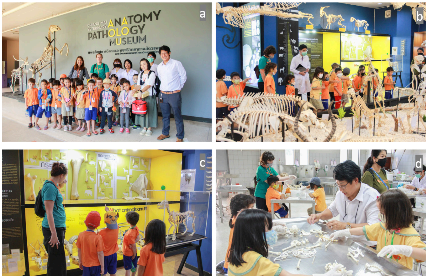
Figure 2 Primary school pupils on a field trip to the museum. Most schools come in small groups (a), as it is easy to organize tours by our staff (b). Children can first look around by themselves (c), while at the end of the tour we offer a basic anatomy class (d).