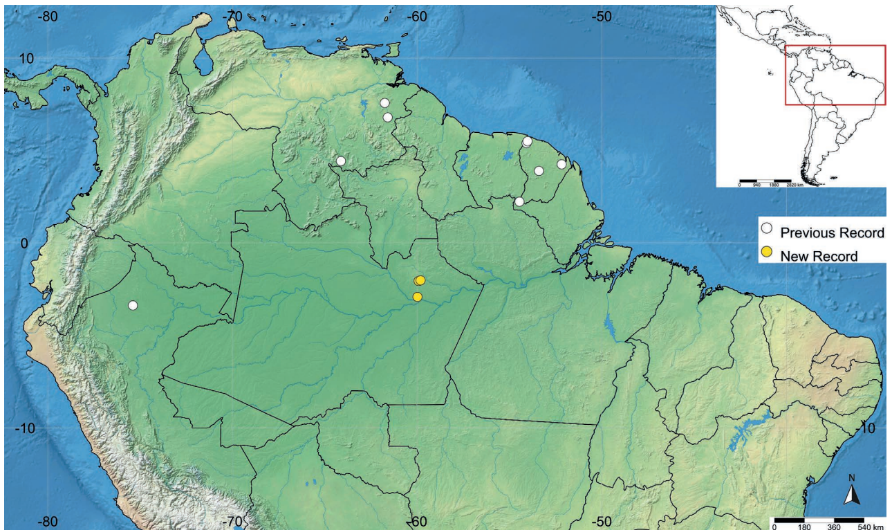
Figure 3. Distribution map of Lonomia camox Lemaire, 1971.