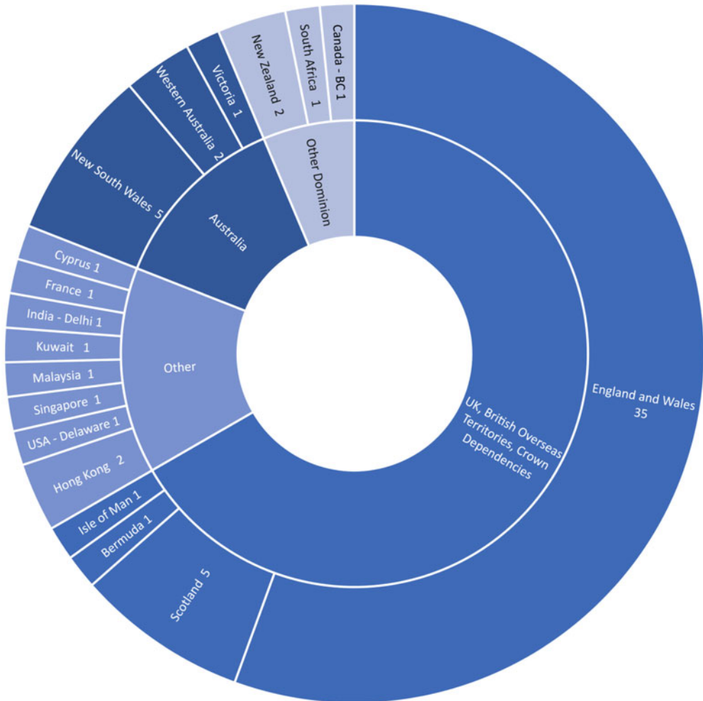
FIGURE 2. Traveling Judges by Home Jurisdiction Excluding Non-Commercial ECSC and The Gambia—June 2021

If one focuses only on the courts in our study most oriented to international commerce, 135 the traveling judges look more like their colonial antecedents. Eighty-three percent are from the UK and long-term Dominions (Australia, Canada, New Zealand, and South Africa). The AIFC courts in Kazakhstan have 100 percent English judges. The rest of our discussion will focus primarily on the judges in Figure 2.