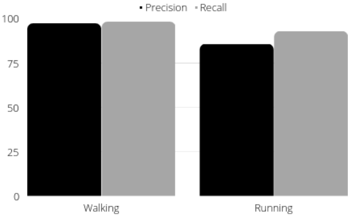
Fig. 2. Neural Network Precision and Recall Scores by Class_id

Additionally, all models were most accurate when identifying 'walking', their precision and recall scores ranging between 97% and 100%. The neural network model achieved a precision of 97.3% and a recall of 98.2% for 'walking". These results were not surprising, given that 'walking' comprised nearly one-third of the true responses in the entire data set. Precision and recall scores for the random forest and neural network model are presented in Table 4 and Table 5, respectively. Overall precision and recall score comparisons are shown in Figure 2.