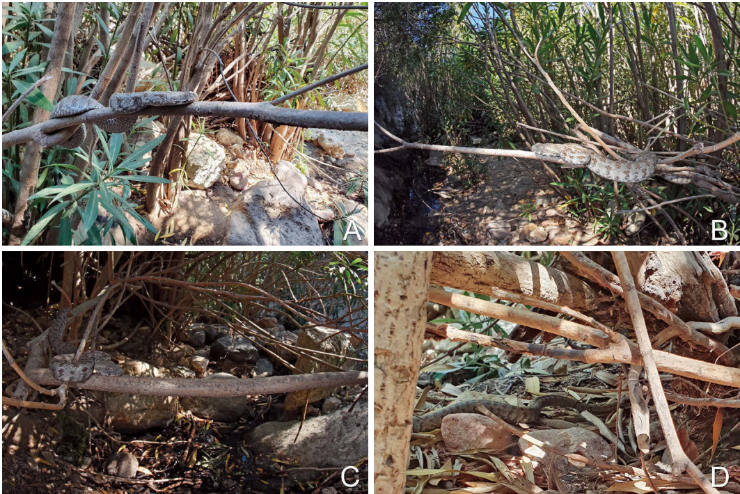
Fig. 4. Macrovipera schweizeri individuals observed “in situ” near the residual pool during the day.

The first record is from the 24 th of September, at 8:58 h (sunny weather, T=19^{\circ}\text{C} , wind = 17 km/h). An individual with uniform, reddish colouration, likely a female (TL = ~ 50 cm), was observed moving among the stones of a completely dry seasonal stream bed (approx. coordinates: 36.66, 24.40; elev. 67 m a. s. l.) (Fig. 2D). In the stretch of stream visited there was no residual water, and the only other vertebrates encountered in activity were Kotschy’s geckos ( Mediodactylus kotschyi , n=2 ) and Milos wall lizards ( Podarcis milensis , n=5 ).