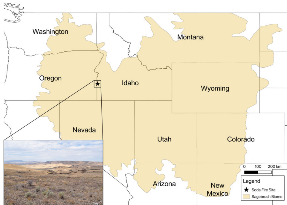
Fig. 1. Map highlighting the sagebrush ecosystems and the site of collection of IDT3 within the Soda Fire site (burned in 2015) in Idaho, USA. Sagebrush ecosystems (also called the “Sagebrush Biome” per Rigge et al. 2020 ) currently cover an estimated range of 653,316 km 2 . The inset shows a landscape photo of the Soda Fire site.

gradient with polyploids dominating the landscape ( McArthur and Sanderson 1999 ). Subspecies tridentata and vaseyana exhibit both diploid ( 2n = 2 \times = 18 ) and tetraploid ( 2n = 4 \times = 32 ) cytotypes, whereas subspecies wyomingensis is only known as a polyploid ( 2n = 4 \times , 2n = 6 \times = 54 ) ( McArthur and Sanderson 1999 ). Common garden experiments indicated that demographic phenotypes are under gene-by-environment control ( Chaney et al. 2017 ). For example, a common garden experiment focusing on growth and fecundity rates was conducted to compare 2 \times tridentata and 4 \times wyomingensis performance across environments ( Richardson et al. 2021 ). This study demonstrated that 2 \times tridentata outperformed 4 \times wyomingensis , even in environments dominated by polyploids ( Richardson et al. 2021 ). The higher performance of 2 \times tridentata raised the question of how polyploids could be more prevalent in the landscape. A reference genome would provide genomic resources for future research aimed at increasing our understanding of observed phenotypes in common gardens, allow researchers to assess how big sagebrush populations have adapted to environmental changes, explain cytotype distributions, and provide a key resource to estimate the effect of climate change on its populations.