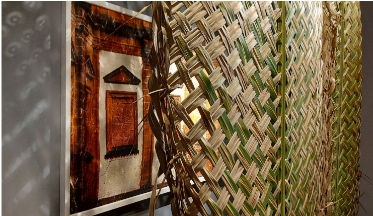
Figure 7: Side View of This is Not the Basilica! (2021).

drop of local materiality and historicity, one through which the artist gives his viewers the opportunity to reckon with past and present as they consider the Basilica's future. Recall that the Salazarist intervention that deplastered the Basilica in the 1950s created its modern-day look by, ironically, aging the building—a technological advancement in aid of de-modernizing its look. Reversing this trend, contesting its meaning-making, what might be achieved by experimenting with past traditions, reinvigorating them for a new take on modernity? Just as mollam could stand in for plastic tarpaulin as an environmentally sound option for protecting buildings against rainfall, so too could the reuse of once-traditional plaster give the Basilica a new lease on life.