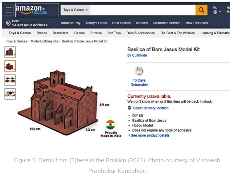
Figure 5: Detail from (T)here is the Basilica (2021).

An entire generation of Goans will have only known the Basilica in its present form, devoid of its once highly contrasting white plaster surfaces. And why should this be a problem? The lime cast which was removed during Castro's renova-