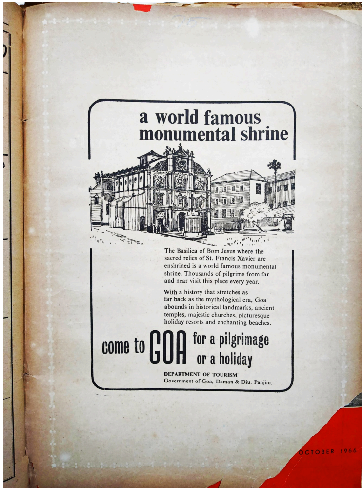
Figure 4: Detail from (T)here is the Basilica (2021).