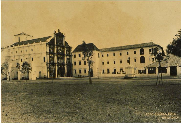
Figure 10: The Basilica of Bom Jesus (Old Goa), photographed in 1890 by Souza and Paul. Photo courtesy of Goa State Central Library.

of Xavier’s feast day, as well as a decadal exposition of his sacred remains. These events draw large crowds of Goans, an occurrence that Kandolkar declares,