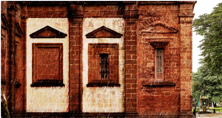
Figure 2: Uncovered Photo Detail from This is Not the Basilica! (2021).