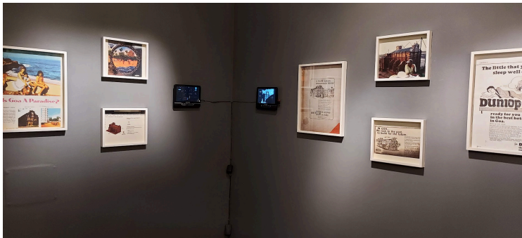
Figure 3: Wide View of (T)here is the Basilica (2021).

use images of the church to still holidays and real estate in Goa. The title of the installation explores the distance between the cultural and historical “there” and “here” of the postcolonial nation and its colony, the centre and periphery. This is poignantly dramatized in Kandolkar’s use of a video segment that shows the Basilica as an emblematic representation of Goa, alongside floats epitomizing other states, in the annual Republic Day parade in New Delhi, India’s capital. If the Basilica is a symbol of Goa’s Portuguese past, situated as it is in the former capital of the now bygone Estado da Índia , then its simulacral reemergence in a national event celebrating the creation of the post-British Indian Republic collapses Goan history into a mainstream national narrative.