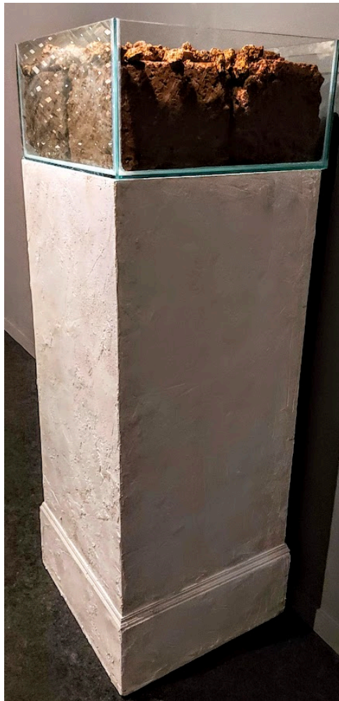
Figure 8: Weather the Basilica? (2021).

Goan architecture as being Portuguese, studies of local built forms or representative visual cultures associated with them, such as photographic histories of the Basilica, would find no room in local curricula in Goa. That church-built forms are associated with Catholi-