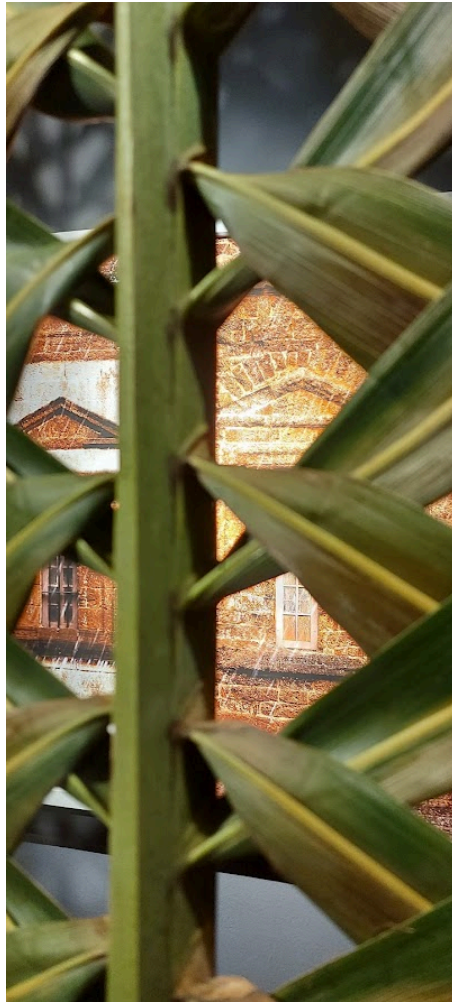
Figure 6: This is Not the Basilical! (2021), view through the Mollam.

that Jews dominate Arabs as a kind of revenge to being dominated by Nazis. So this is the topic for discussion” (Godfrey). The importance of this subject was one that was close to the late Jewish artist’s heart, having escaped the holocaust by fleeing from Germany to England