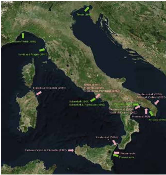
Fig. 1 - Italian Peninsula's map showing the reports of the two discussed species. The reports of Calliopaea bellula are green coloured, while those of Tayuva lilacina are pink coloured. Each report is joined with the corresponding reference/s. / Mappa della Penisola Italiana che mostra le segnalazioni delle due specie discusse. I ritrovamenti di Calliopaea bellula sono colorati in verde, mentre quelli di Tayuva lilacina sono colorati di rosa. Ogni segnalazione è accompagnata dai corrispondenti riferimenti bibliografici.

2010). This last author considers as valid only one of these species, T. lilacina , rendering the other species of the genus as synonyms of the latter, which most likely would represent a complex of species, widespread in several parts of the globe: Caribbean Sea, Eastern Pacific, Tropical Indo-West Pacific, Mediterranean, and European Eastern Atlantic. With regard to the last cited areas, this species was given several names throughout the years, (Dayrat, 2010): Discodoris maculosa , D. concinna , D. confusa , D. fragilis , D. lilacina and Tayuva maculosa . The species was generally detected beneath rocks, from the intertidal to 24 m depth (Swennen, 1961; Schmekel & Portmann, 1982; Ballesteros et al. , 1985; Wirtz, 1995). According to Dayrat (2010), due to the large number of reports in the literature and on the web, as well as museum specimens, T. lilacina would appear to be a common species. In Italy, this species was reported in Naples (Campania) as Discodoris maculosa (Bergh, 1884; Schmekel, 1968; Schmekel & Portmann, 1982), in Porto Cesareo (Apulia) as D. maculosa (Perrone, 1983), in Lecce and in Taranto (Apulia) (Furfaro et al. , 2020; Vitale & Colucci, 2022) and at Tavolara-Punta Coda Cavallo (Sardinia) (Trainito & Doneddu, 2015) (Fig. 1). More information on this species can be found in Ballesteros et al. (2022).