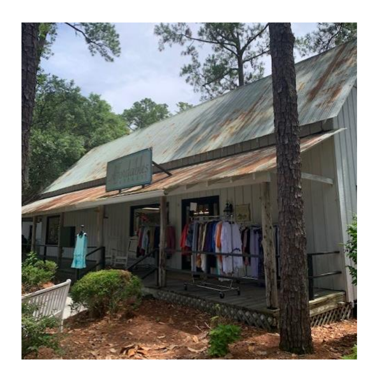
Figure 12: Building Number 17 in the Hammock Shops property is currently occupied by a clothing store called Affordables. This building was constructed in the late 1900s to resemble Archibald Rutledge's Summer House in McClellanville, SC. (2022)