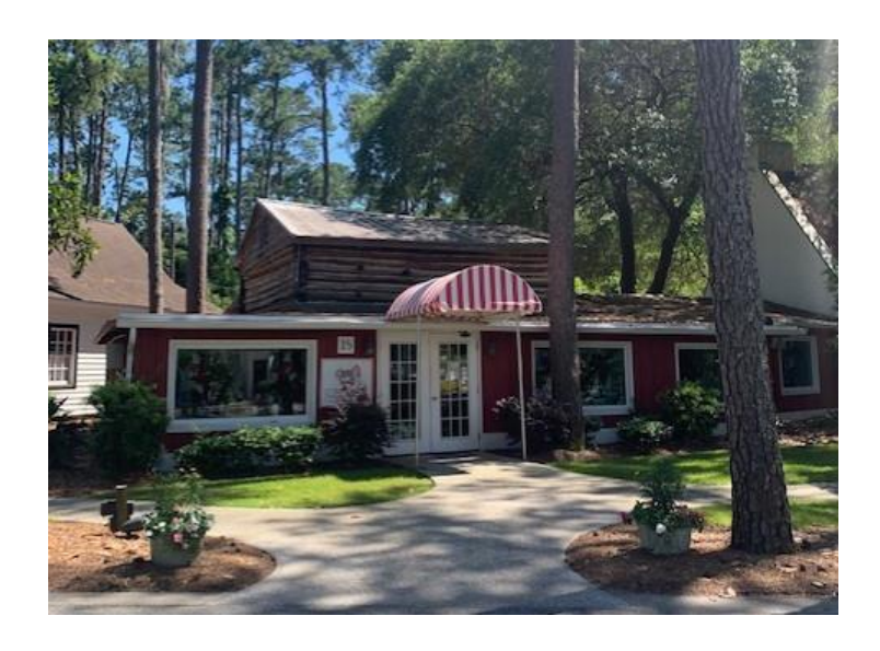
Figure 10: Front exterior of the tobacco barn. Currently occupied by the business Christmas Mouse.