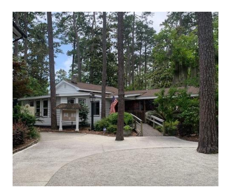
Figure 9: Front exterior view of the "Waverly" building. This building was originally on the Waverly Plantation and built in the early 1800s, acting as the first post office of the area as well as the business office of P.R. Lachicotte and Sons, which included a rice consortium, barrel factory, lumber mill, nail factory, and a marine railway. The building was moved to the Hammock Shops in 1983. The building is currently occupied by the restaurant business BisQit. (2022)

Database, 2020). It was not until 1939 when the post office was moved to the highway, the area was getting increasingly popular for tourists, and rice was no longer being milled, that the postmark was officially changed from Waverly Mills to Pawleys Island. The "Waverly Building" also concurrently acted as the business office for P.R. Lachicotte and Sons, a diverse business that included a rice consortium, barrel factory, lumber mill, nail factory, and a marine railway (Interview with Lee Brockington, 2022).