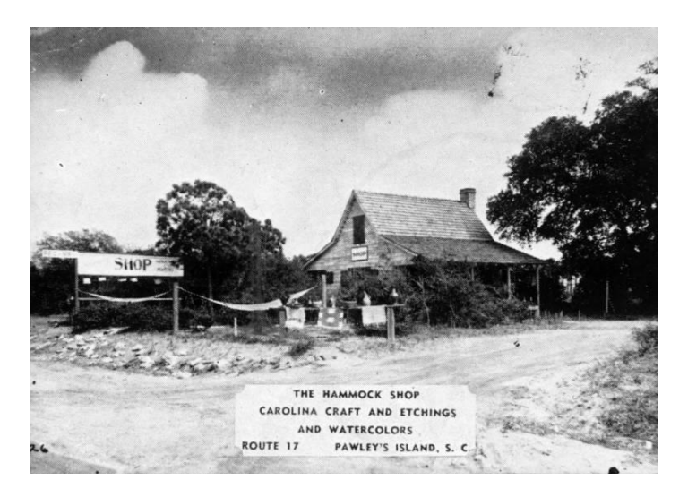
Figure 2: A photo sourced from the Pawleys Island Civic Association, showing the Original Hammock Shop the year that it was first opened. (1938)

The Original Hammock Shop building was built in 1938 (Figure 2 and 3). In 1971, Doc Lachicotte's son, Arthur Herbert "Lil Doc" Lachicotte, decided to remodel the building, using a variety of materials intended to reflect the history of the area. All the lumber in the two main rooms of the building were repurposed from early 1700s slave cabins (Figure 5). These cabins were known as "Daddy Flander's Cabins" and were located at the Richmond Plantation, owned by the Pyatt family. Long hand-hewn beams in the original hammock shop came from Maryville Plantation just south of the city of Georgetown. These beams were built around the year 1810 (Figure 4). A rice millstone is built into the brick floor, which was taken from Waverly Plantation (Figure 6). All the bricks in the building originated in England and were "used as ballast in sailing vessels coming to America" (Dyer, Original Hammock Shop sign, c.1980).