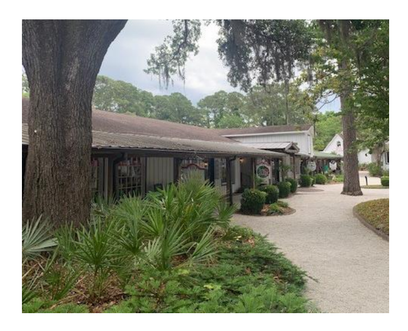
Figure 11: Angled view from the left side of the front of the original Hammock Factory. (2022) Carolina Low Country Cottage

The "Affordables" business is located in building number 17 in the Hammock Shops. This building is typical of Low Country cottages which are found along the South Carolina coast. The building is also a close facsimile of "Summer Place" which was the summer home of Archibald Rutledge, who is primarily known as the first poet laureate of South Carolina from 1934 to 1973. Summer Place was built of logs and constructed in 1870 by Archibald Rutledge's father and still stands in McClellanville, SC. The location of Summer Place on the salt water "was considered to have a more healthful climate" (Bodie 1980, 18). The Rutledge family was a prime example of rice plantation owners in South Carolina that would flee their plantations in the summer to escape the malarial mosquitos and swamp fever.