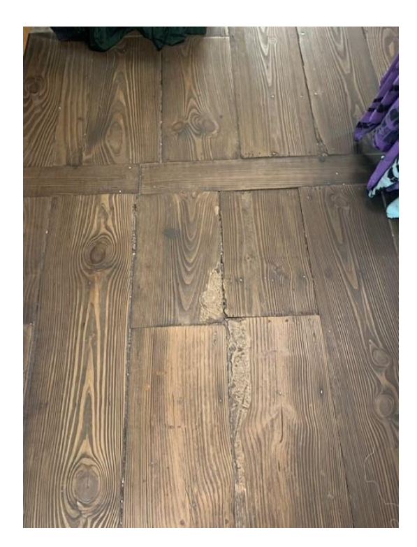
Figure 5: Lumber from slave cabins of Richmond Plantation. Interior of Original Hammock Shop. (2022)