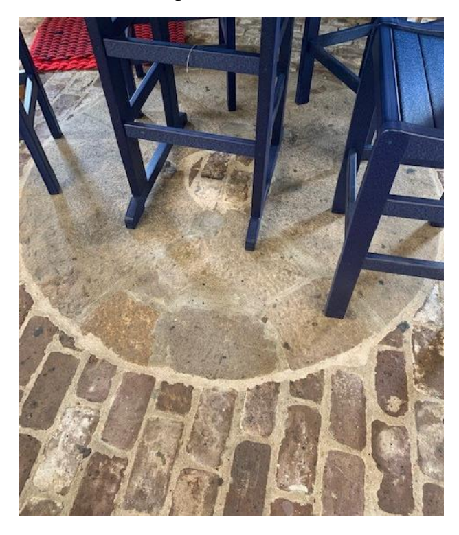
Figure 6: Rice milling stone from Waverly Plantation. Interior of Original Hammock Shop. (2022)