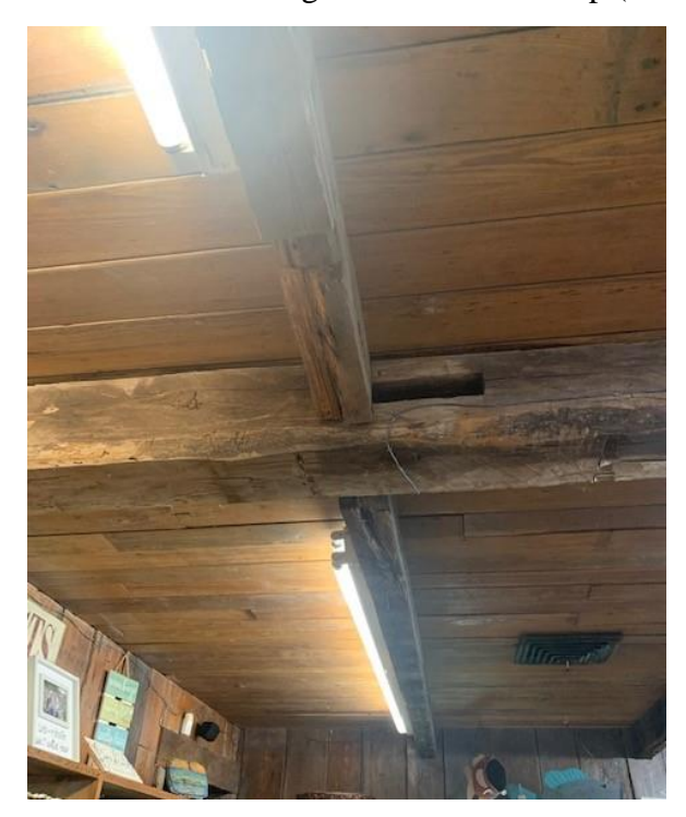
Figure 4: Hand-hewn beams from Maryville Planation. Interior of Original Hammock Shop. (2022)