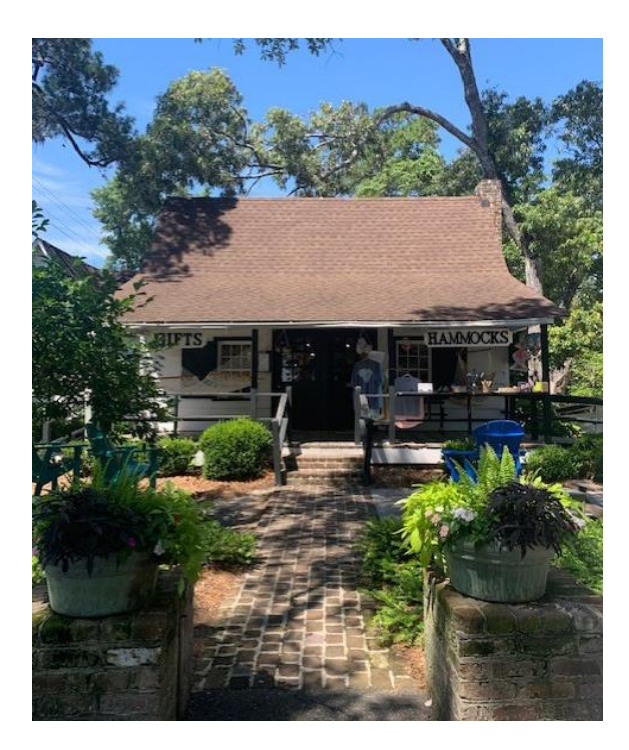
Figure 3: Front exterior of Original Hammock Shop (2022)