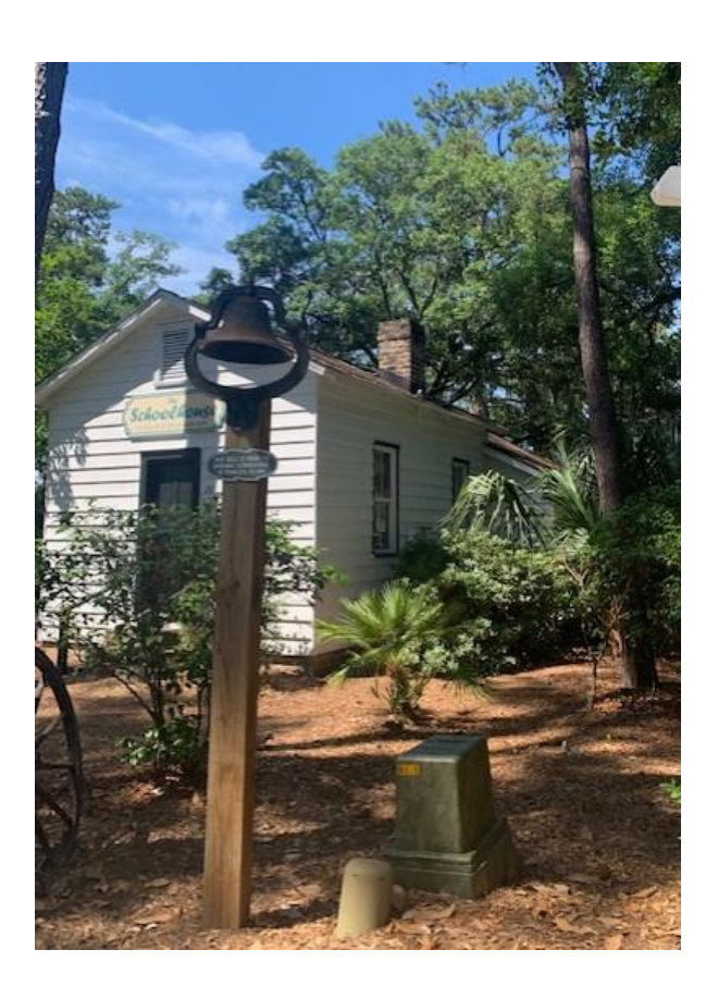
Figure 8: Back exterior of the Schoolhouse. Front ground of the photo includes the schoolhouse bell from the original site of the school on Waverly Plantation. (2022)