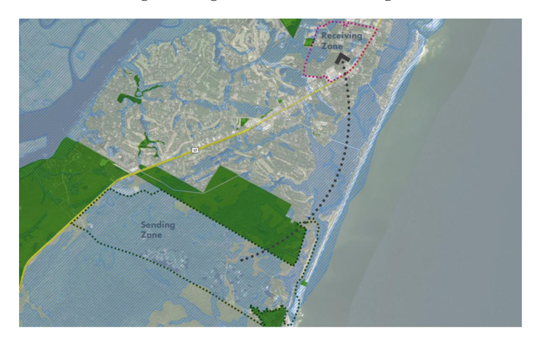
Figure 3: Potential Sending/Receiving Zones for New TDR Program

land while promoting the development of areas that can support growth. A model example of the number one nationally ranked TDR program comes from Montgomery County, Maryland. Montgomery has preserved over 50,000 acres through TDR's and saved their county a projected $65 million in development costs. <sup>19</sup> As seen in "Figure 4", the protection of natural resources of various types ranks "very important" to its community members. <sup>20</sup> By implementing a TDR program here in Georgetown County, the OPZ would be working towards UN SDG #11 by simultaneously tackling issues in rapid urbanization and natural resource protection. This is demonstrated in "Figure 3" through the protection of natural resources in the sending zone and supported growth within the receiving zone. If implemented here in Georgetown County, this solution could function as a model sustainable community for others to follow around the world.