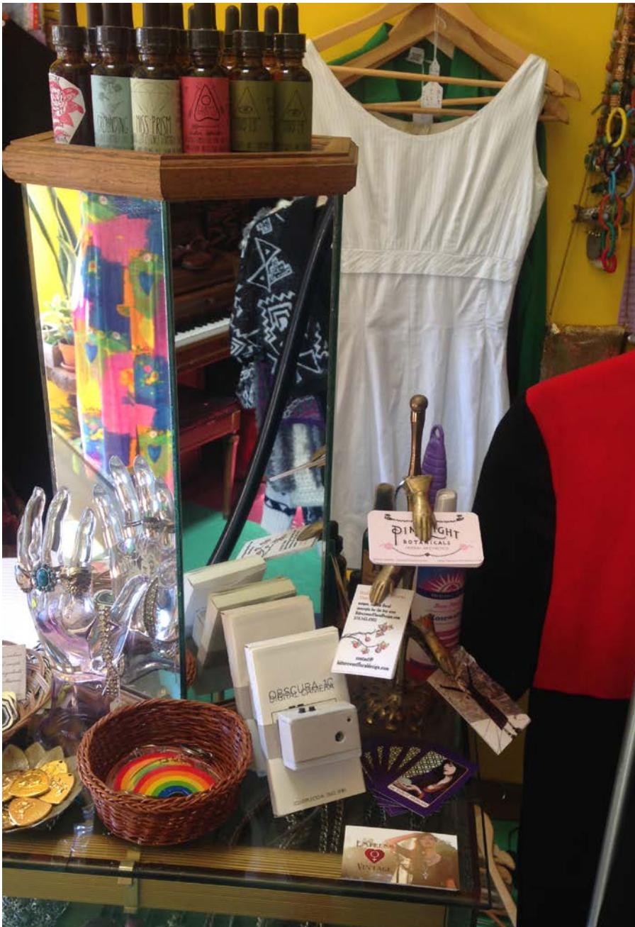
Figure 2. The Obscura 1C was displayed in retail partnerships (above) or “droplifted” into stores.

Holmes to unfold such that any faltering of the detective’s deductive reasoning would be perceived as false or a negative development in the character’s intellect.