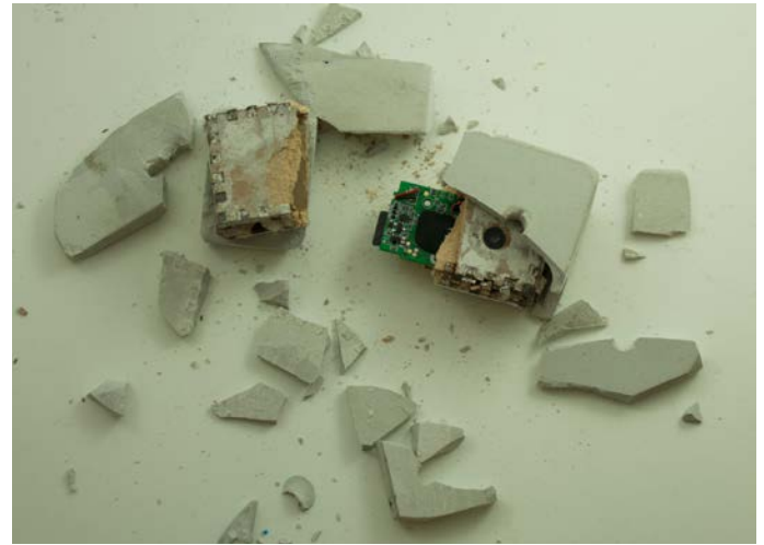
Figure 1. The Obscura 1C and the camera destroyed.