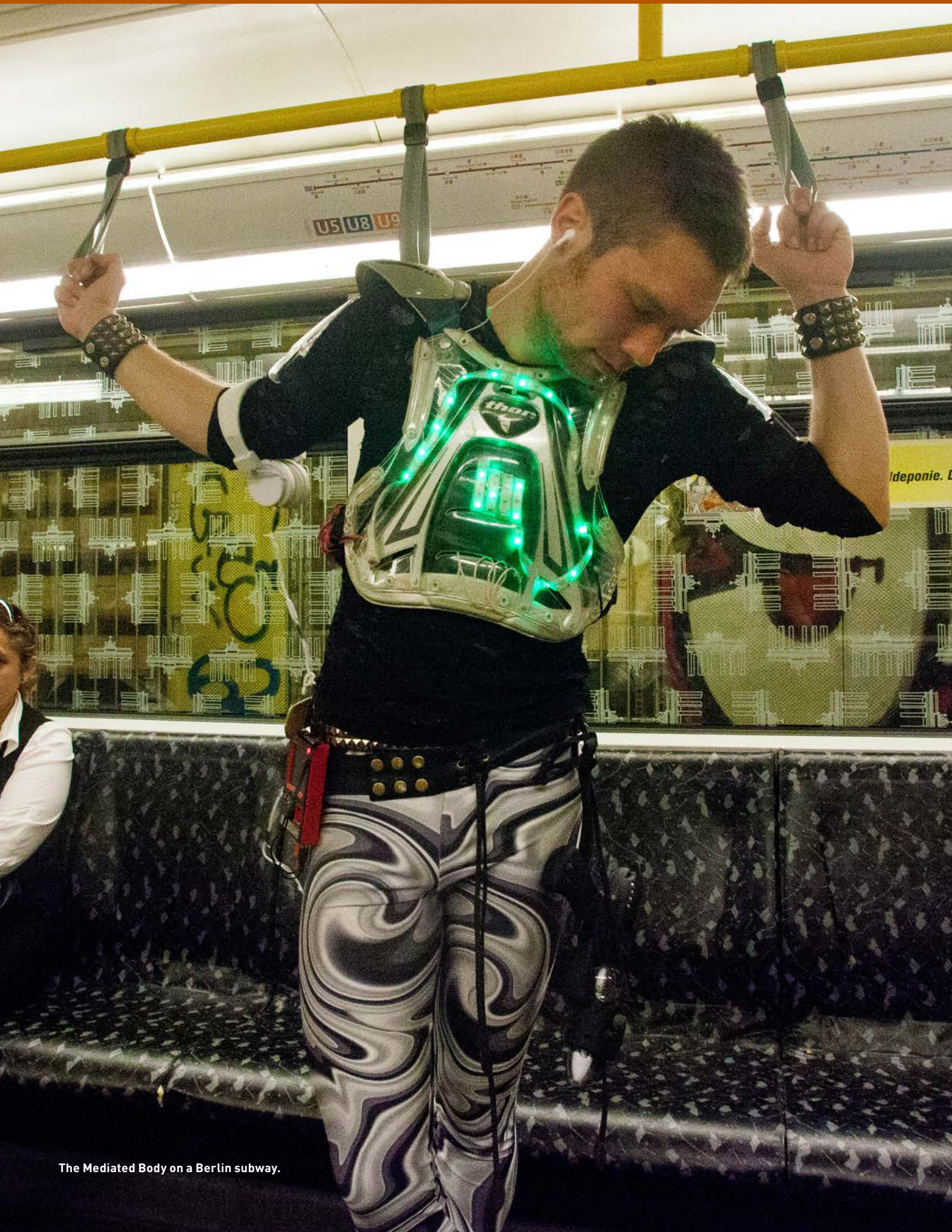
The Mediated Body on a Berlin subway.