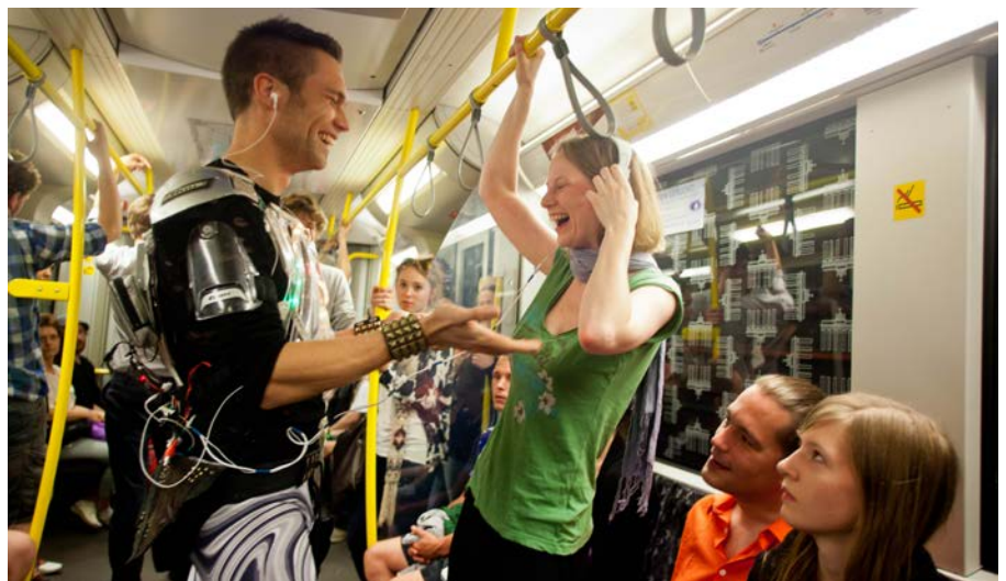
Figure 4. The Mediated Body performed on a Berlin subway among many onlookers.