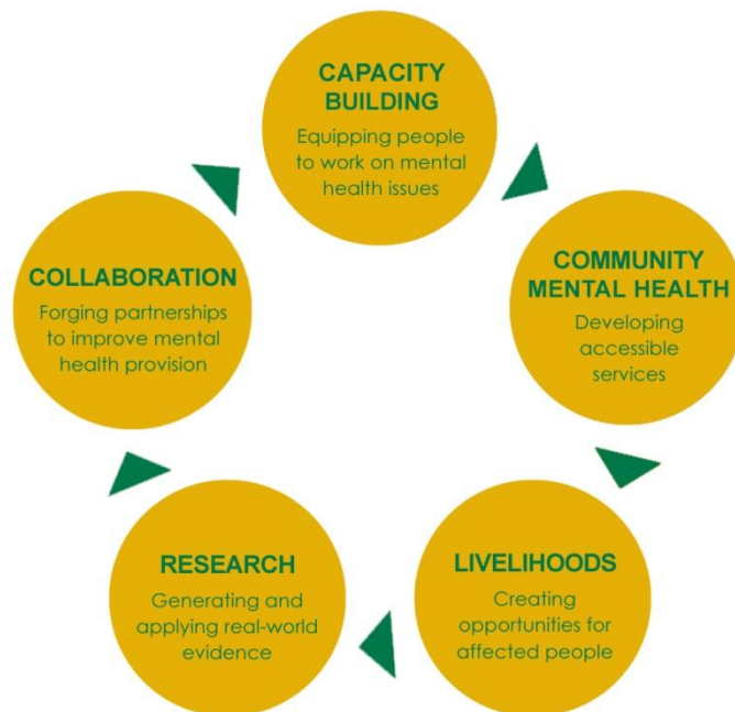
Figure 2: The BasicNeedsModels

BasicNeeds is an international non-governmental organization working in 12 countries globally, including Pakistan to improve the lives of people with mental disorders. Their main goal is to integrate “the BasicNeeds Model”, (Fig. 2), into Pakistan’s mental health care system by working across the system with individuals, communities, local and national government and international organizations to achieve basic human rights for people with mental illness (BasicNeeds, n.d.).