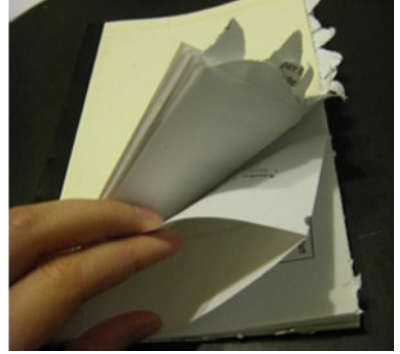
Figure 4. Trace lines connecting repairs and broken parts (top) and a tear book (bottom) showing speculative reframing.

course, more specifically their design decisions in the construction of their project.