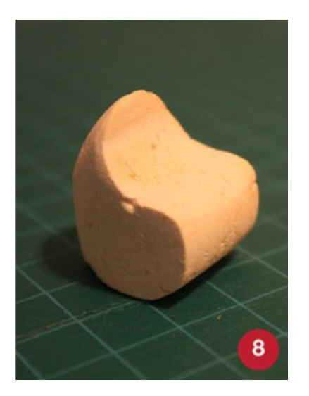
Figure 5. A yam potato used as prototyping material.