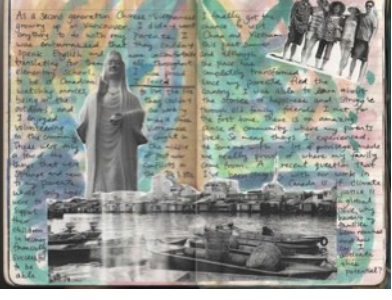
Figure 2. Collages in a visual journal: Another example of a reflective and creative portfolio.

exploration of what we can learn about design activism in the classroom for HCI education and moreover, inform our first reflections on the role of design activism in HCI.