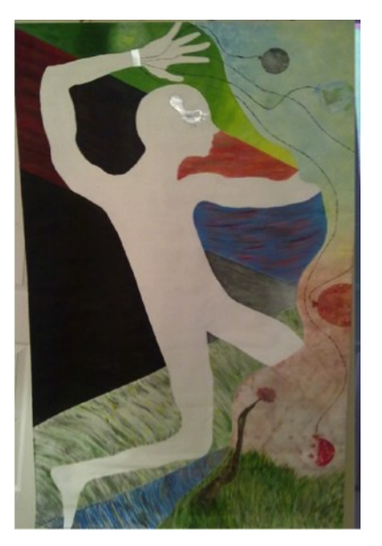
Figure 1. Body Mapping painting: a portfolio representing the growth of a student throughout the semester.

journey to realize a state of being, as well as a desire to contribute to a greater societal good" [8, p.20]. This implies that design activism demands designers to learn, reflect and take on a certain position.