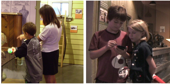
Figure 4. Mother and her son “pause” to discuss a challenge (left); boy explaining to his sister what she needs in order to complete a challenge (right).

synthesis of data points that include the above plus observations based on video and audio recordings, and the follow-up self-administered interviews.