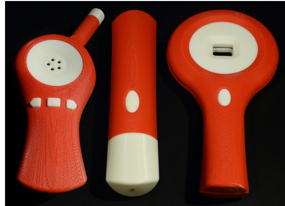
Figure 2. Tangibles from left to right: listener , pointer , reader .

Kurio is a hybrid system comprised of a set of tangible computing devices, a PDA, and a tabletop display. We used