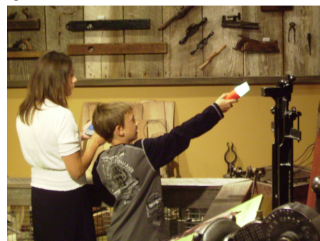
Figure 1. Mother and her son with Kurio.

In this paper, we focus on a description and discussion of the system with particular emphasis on the tangible user interface within a hybrid system and evaluation of the design goals. We will detail technical details, user